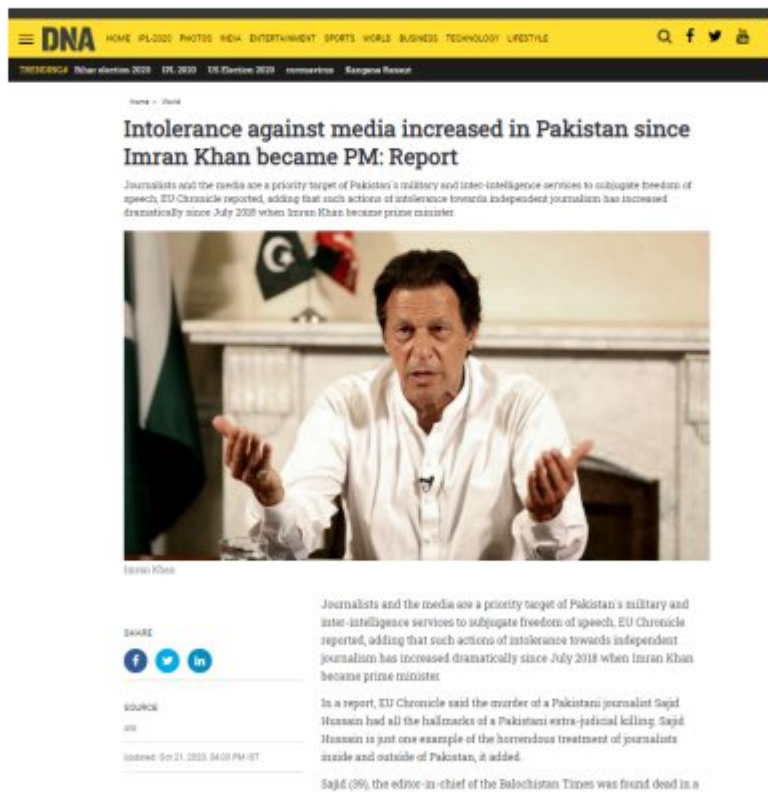
Screenshot: DNA India article syndicating an ANI report, which is based on article from EU Chronicle 192 .

On October 21 st , DNA India (2.2M followers on Twitter) republished a report from ANI. This article is a modified version of an original article from EU Chronicle about a book published by the Council of Europe titled “A mission to inform: journalists at risk speak out”. The change from the EU Chronicle article were made to attack Pakistan more directly.