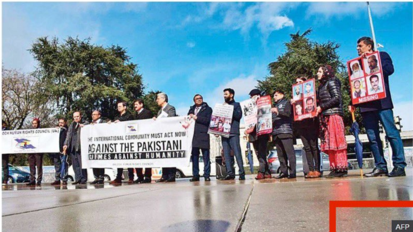
Protesters demonstrate against Pakistan outside the UNHRC in Geneva last year

rights to ultimately serve geopolitical interests and gave a platform to far-right politicians when convergent objectives could be reached."