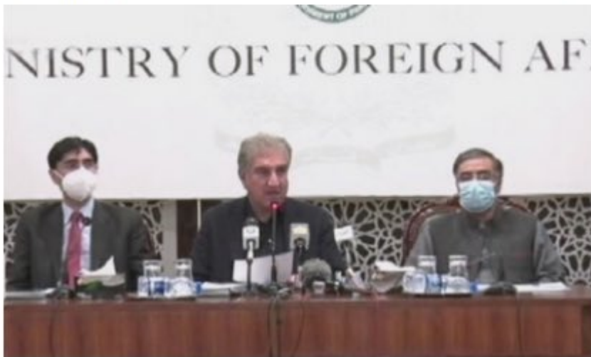
FM Shah Mahmood Qureshi and SA/PM National Security Mawad Yusuf address a press conference on Friday.

Foreign Minister Shah Mahmood Qureshi on Friday called upon the United Nations and the European Union to take notice of and initiate a probe into a massive disinformation and propaganda campaign being "run by India" to promote anti-Pakistan sentiment on an international level.