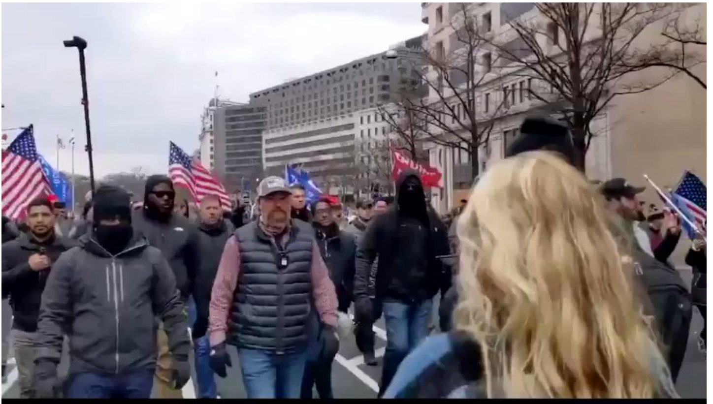
Just found this on Alex Jones' wife's feed near her photo captioned, "Preparing for Battle."

Chilling propaganda w explosions over. @JoeBiden, "artwork": "Fight for Trump," MAPS, & Alex talking about #Trump's meeting with #RogerStone, "big things afoot." #TrumpSupporters