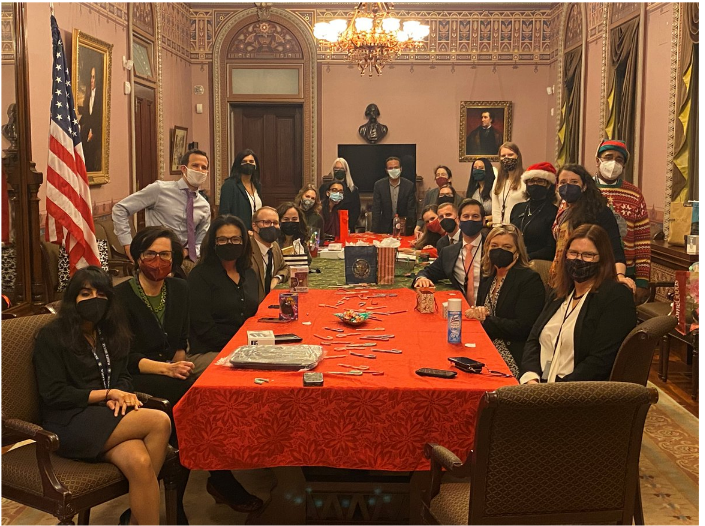
Our team did all that extraordinary work under very tough circumstances—often masked, sometimes caring for sick family members. I'm grateful to everyone at DPC and the @WhiteHouse who delivered for the American people this past year. Can't wait to see what we get done in 2022.