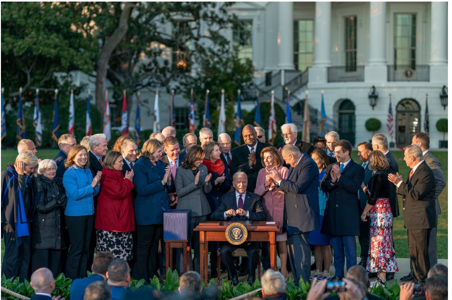
5. We increased the Child Tax Credit from $2,000 to up to $3,600 per child