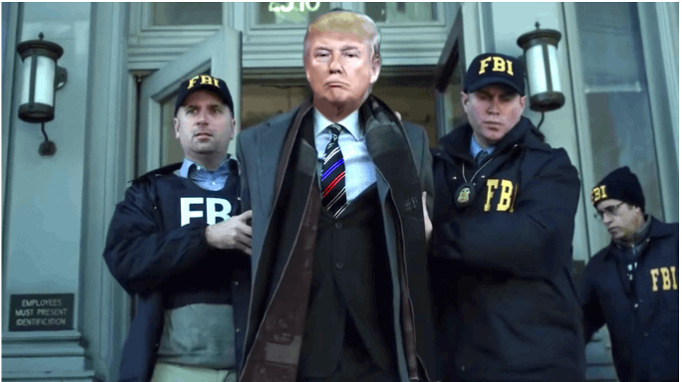
Path 6 - Mark Meadows First Thread/28

If FBI investigation STARTED this April, we are REALLY EARLY into it. Normal time frame for a CONSPIRACY crime is about 2 years to the first arrests at low levels (Jan 6th investigation is going FASTER than normal)