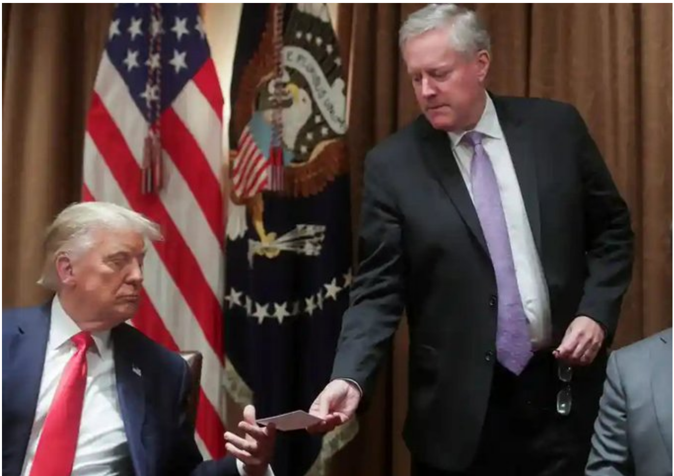
Path 6 - Mark Meadows First Thread/2

This is the Sixth Path to take Trump to prison for life. It is named Mark Meadows who is a key player to get Trump convicted in espionage, related to stealing 325 classified documents in Trump's attempt to sell US secrets to US enemies