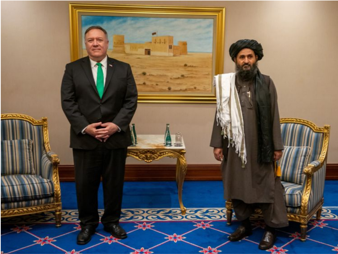
Path 6 - Mark Meadows First Thread/37

Currently Trump is desperately attempting every delay gimmick he can think of. The Special Master gambit bought Trump a week or two, but FBI & DOJ will prosecute espionage with the grave emphasis this crime against USA demands.