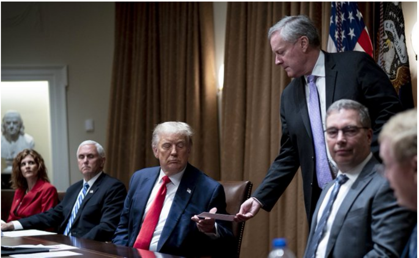
Path 6 - Mark Meadows First Thread/27

If FBI investigation STARTED this April, we are REALLY EARLY into it. Normal time frame for a CONSPIRACY crime is about 2 years to the first arrests at low levels (Jan 6th investigation is going FASTER than normal)