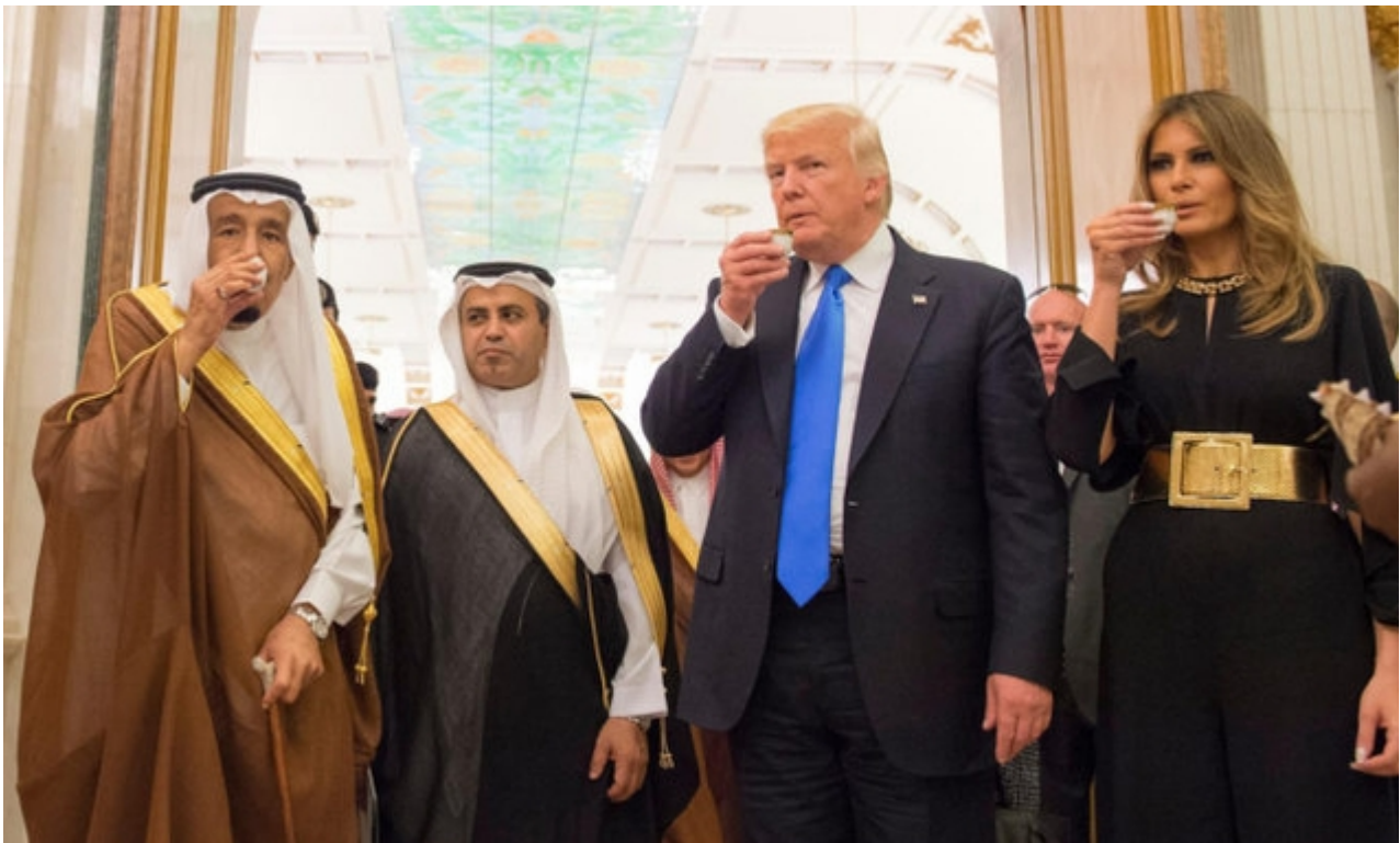
Path 6 - Mark Meadows First Thread/8

We do not YET have ANY sign that Trump had even 'attempted' to sell any of secrets he stole. But if he did, and we add say 20 years per attempt, on say 20% of the files he took, and half of those were attempted to 3 clients = 2,600 years MORE