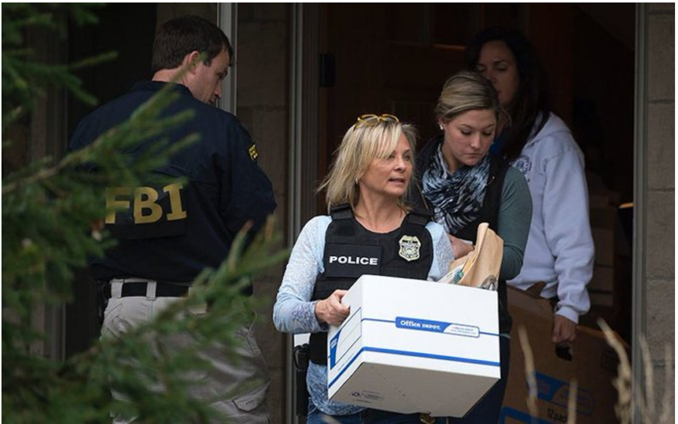
Path 6 - Mark Meadows First Thread/7

We do not YET have ANY sign that Trump had even 'attempted' to sell any of secrets he stole. But if he did, and we add say 20 years per attempt, on say 20% of the files he took, and half of those were attempted to 3 clients = 2,600 years MORE