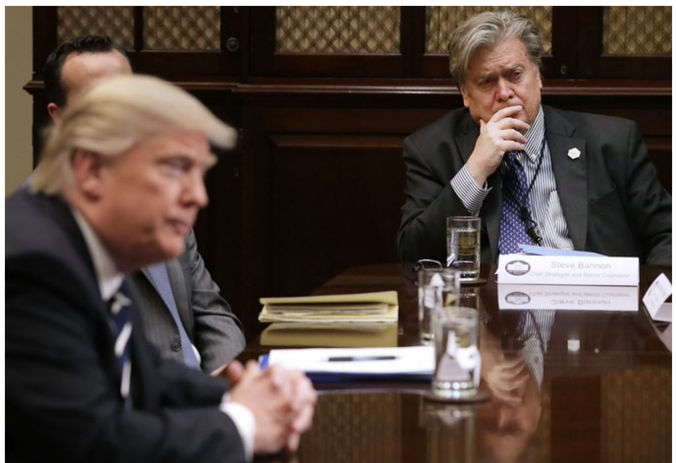
First. Understand.. we know the 2 dozen organizers, plotters, planners of January 6th. They will ALL go to prison, for at least a decade, most for Life. Including the few who get plea bargains in the Grand #Flippathon