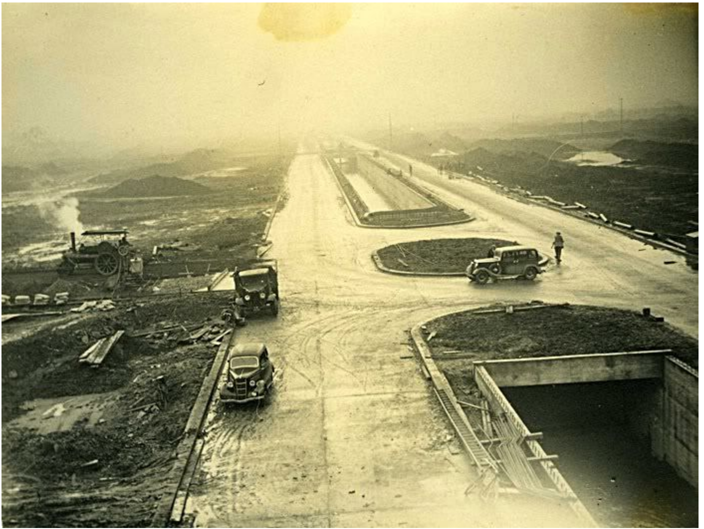
The 700 acre site, designed by the 29yr old William Holford was transformed from boggy land using colliery waste. Holford was a key figure in 20thC urban planning: a member of the panel that selected Lúcio Costa's plan for Brasília + he worked on the plans for Durban & Canberra