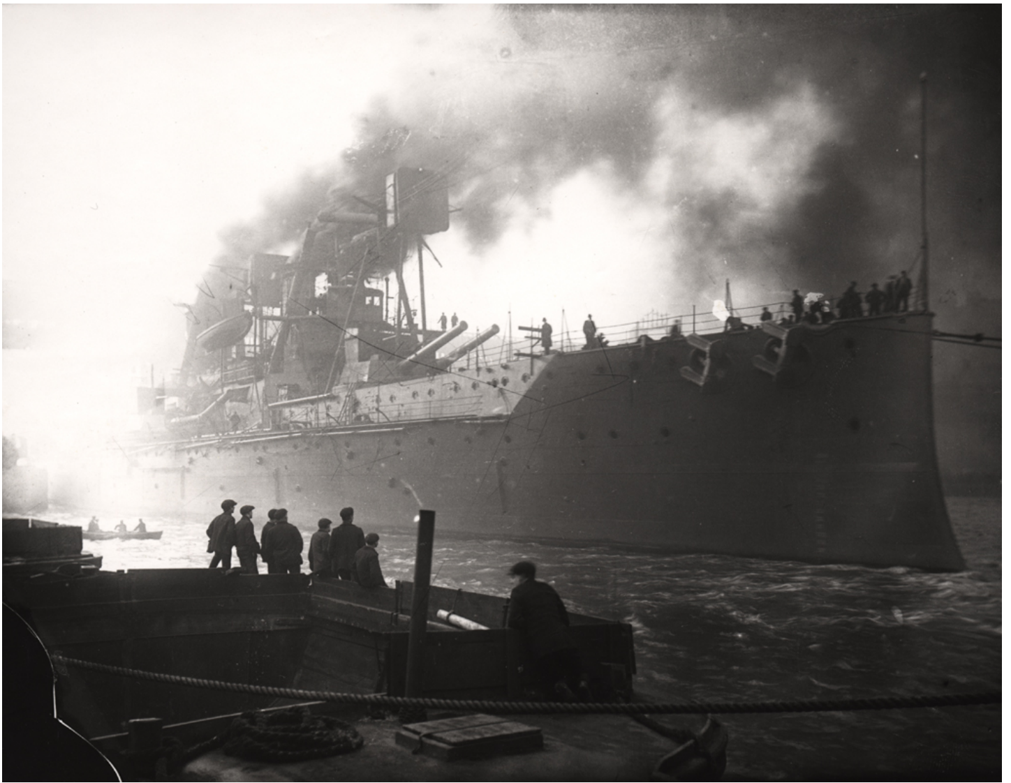
But demand for coal and armaments had cratered. In 1936, men even marched from Jarrow to London to highlight their desperation at mass unemployment. In Jarrow, it reached 80 per cent. In nearby Gateshead it was 57 per cent.