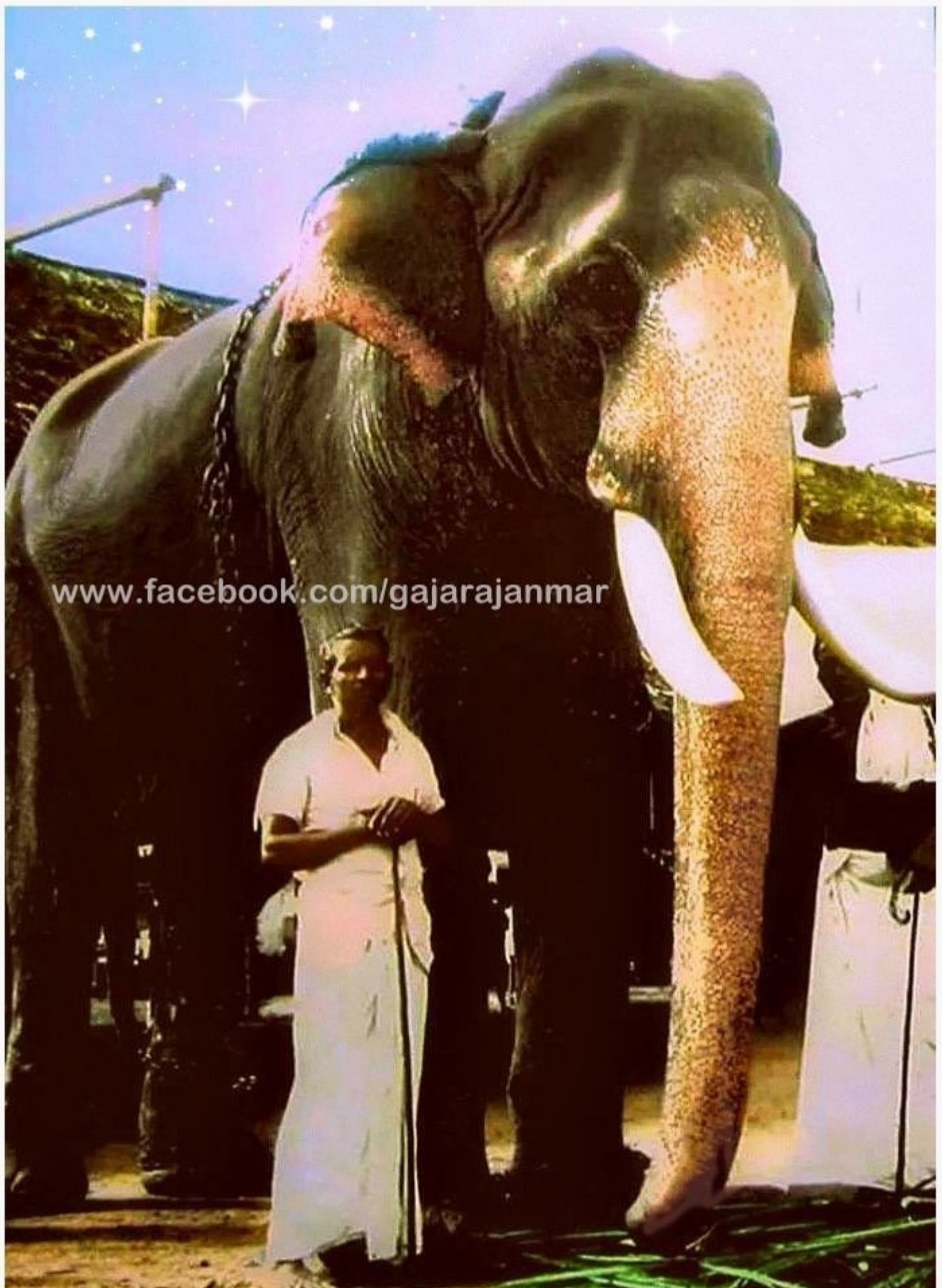
To offer an elephant. His wish was fulfilled and he offered an elephant which later became the famous Guruvayur Kesavan. Kesavan was 10 years old when he came.