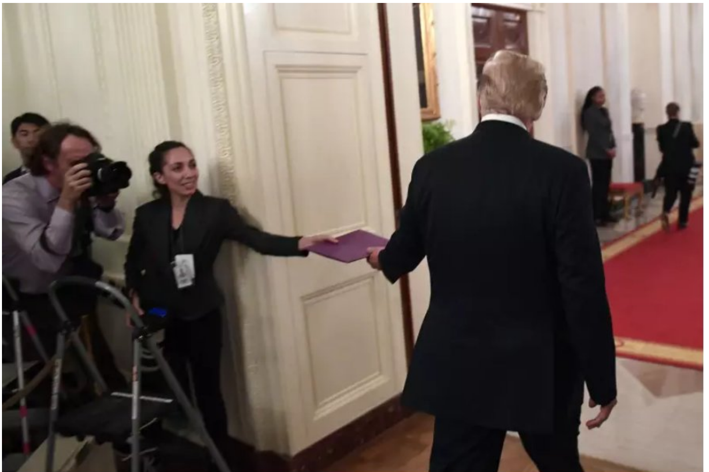
President Donald Trump is handed a folder by Epoch Times photojournalist Samira Bouaou on Wednesday, Sept. 12, 2018.

Here's that 'crime' captured for posterity: