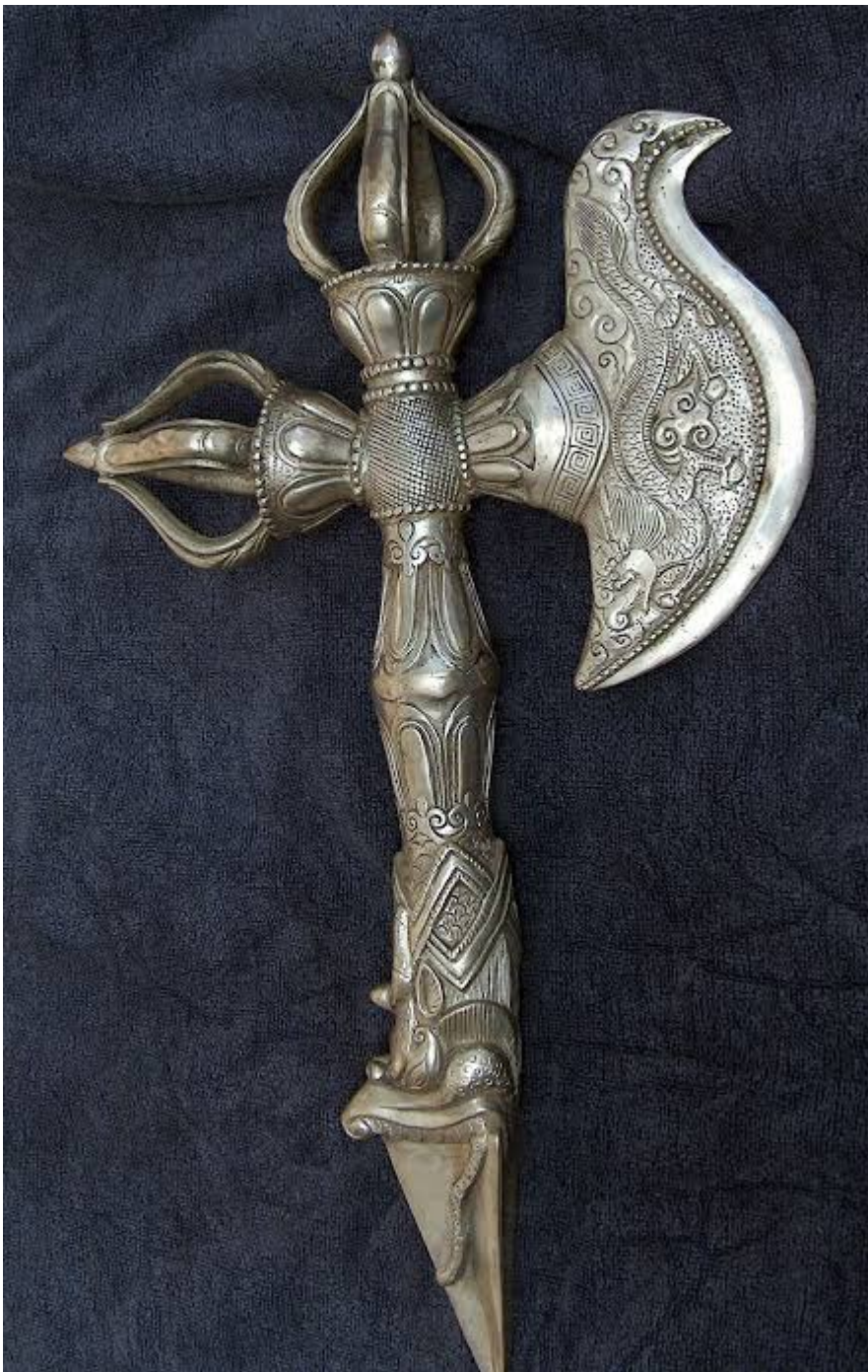
CHANDRAHASA SWORD: The divine sword Chandrahasa literally means ‘the laughter of the moon’. Ravana gave this sword to Indrajit on different occasions especially to fight against Devas. GIRISH: A special sword of Shiva with unique characteristics.