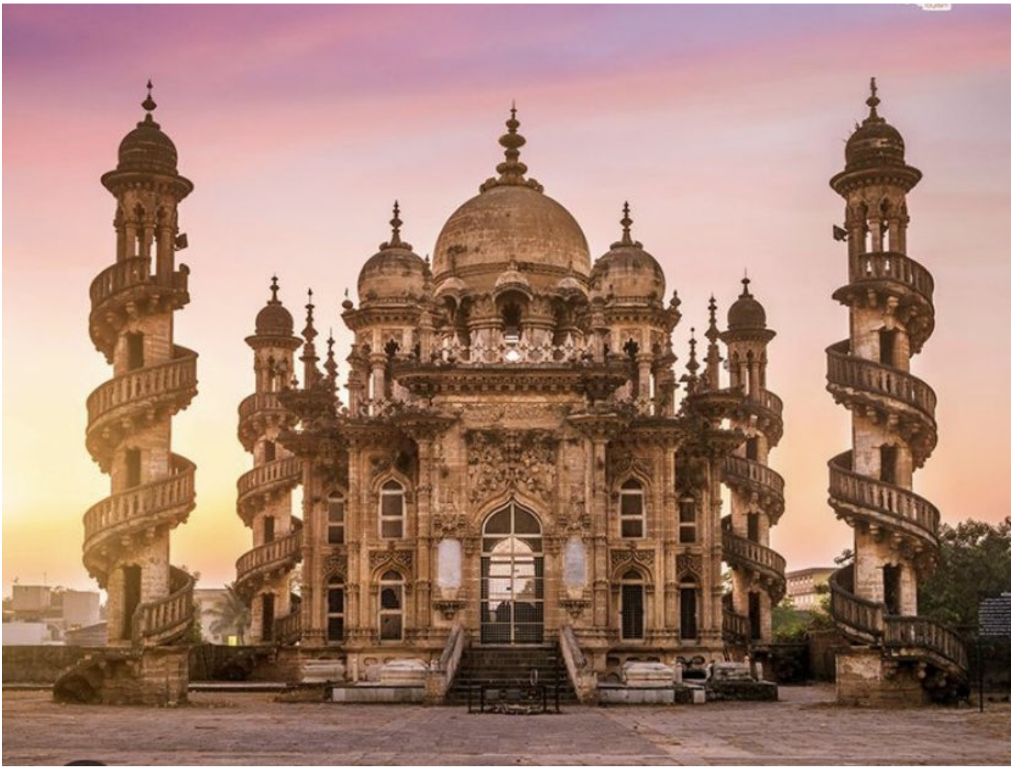
(7/15) Malwa sultanate - Founded by Afghan Dilawar Khan in 1392 and lasted till 1562 CE after which Akbar consumed it into the Mughal empire.