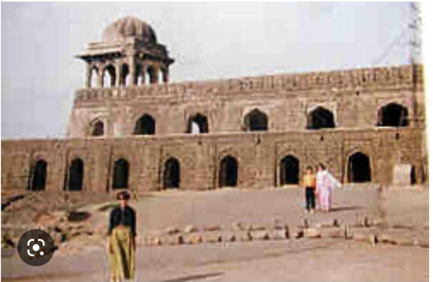
(8/15) Nawabs of Awadh - Establishes in 1724 by a Persian called Sadaat Khan as semi autonomous body of Mughal empire after is collapsed post Aurangze's death. Was finished in mutiny of 1857 by British.