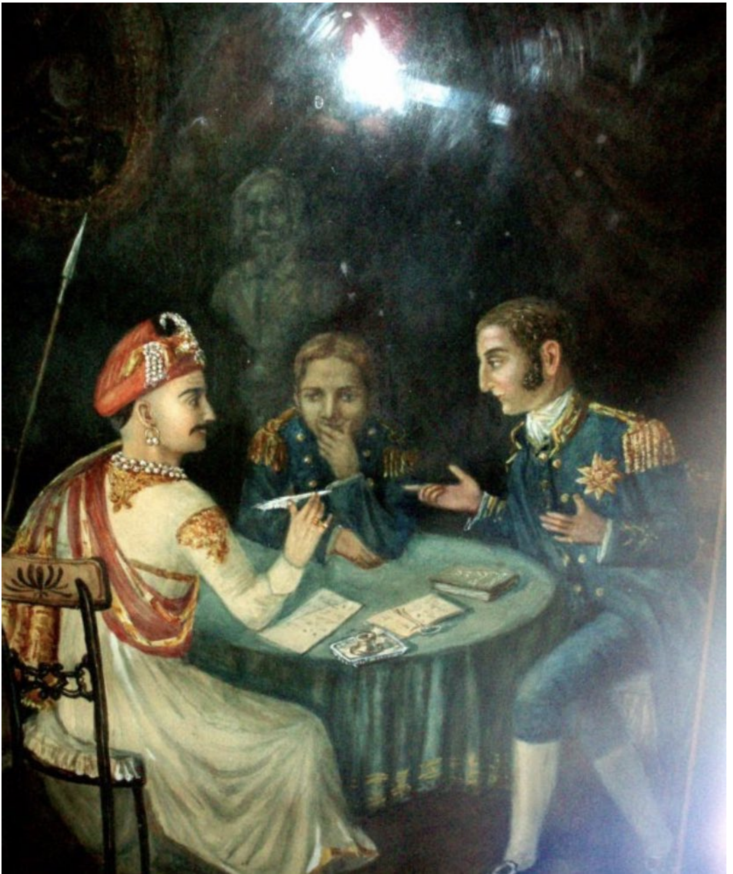
(13/14) Nana Saheb 2 - Adopted son of Bajirao 2 who despised his hedonist father. Wanted 2 be everything his father was not. A most interesting story. He gave a final shot at regaining Maratha glory in the rebellion of 1857 but lost. Finally escaped to Nepal & died there in 1859