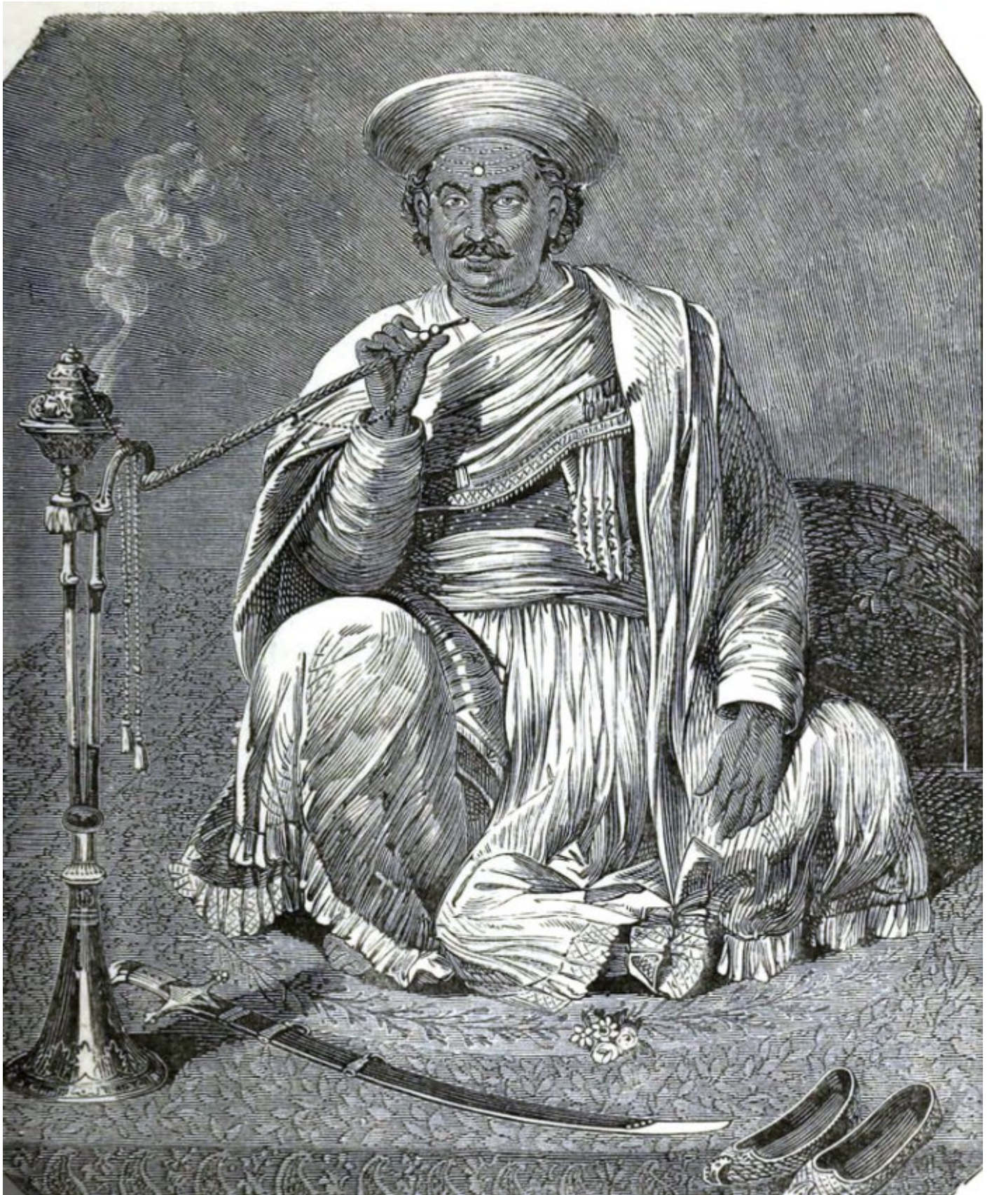
(14/14) Lakshmibai/Manikarnika - She was actually in the artificially created village of Bithur where Bajirao 2 was exiled as her father worked for him. Her childhood friends were Tantia Tope & Nana Saheb. Destiny made her Queen of Jhansi & she died fighting British EIC in 1857