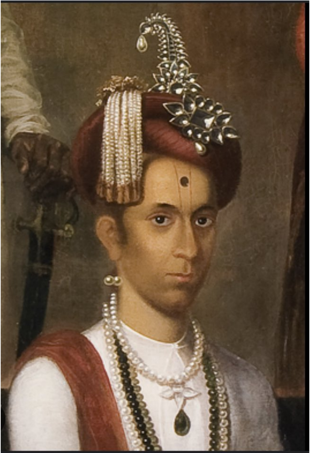
(8/14) Mahadaji Shinde - Reinstated Maratha power in North India after the Panipat 3 & one of the main generals of the Maratha confederacy in Gwalior. By his time Maratha empire was a union of confederacies & not a single empire