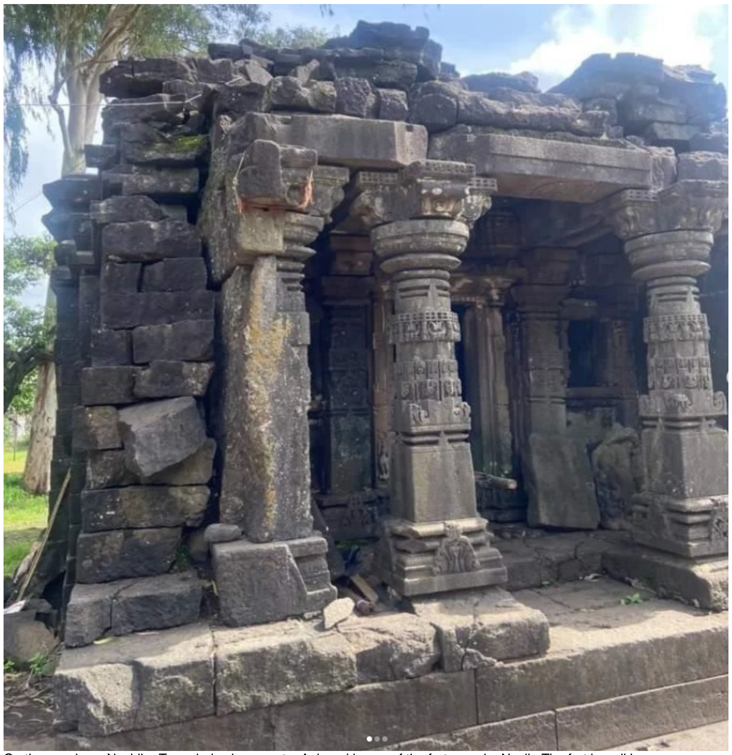
On the very busy Nashik - Tryambakeshwar route, Anjaneri is one of the forts nearby Nasik. The fort is well known among trekkers and is also widely considered to be the birthplace of Hanuman.