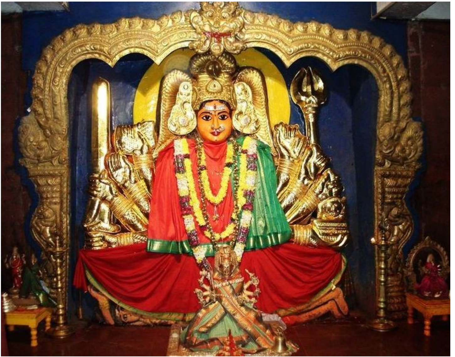
...as their tutelary deity, and fixed the left eye of the goddess with the rare Kohinoor diamond.