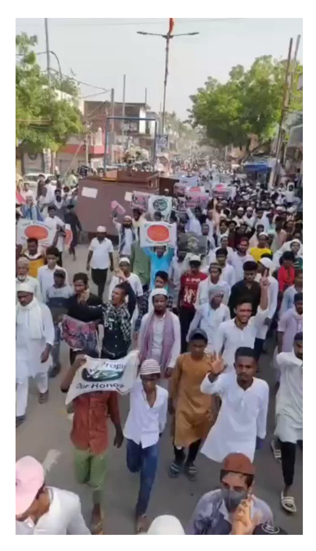
9. You hear 'Sar Tan Se Juda' Slogan in this different rally of SDPI too