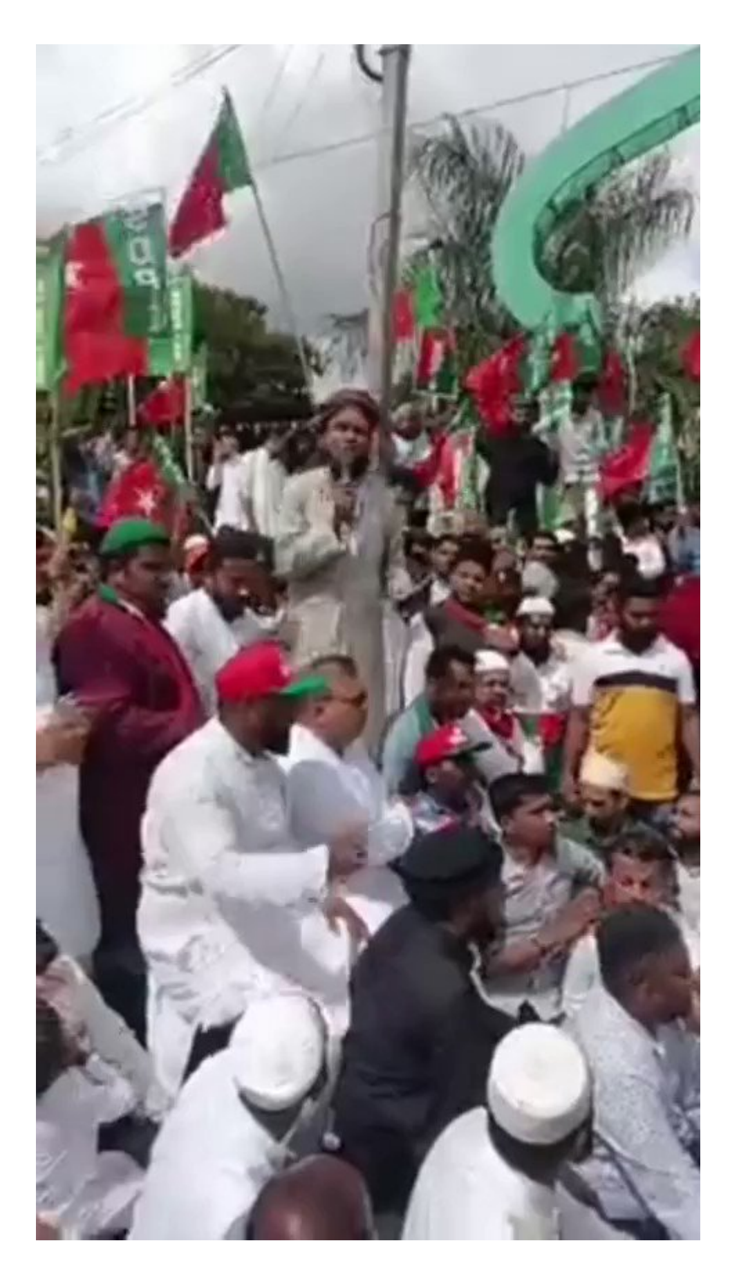
4. In this video radical SDPI leader is warning that this is not the India of 1992!