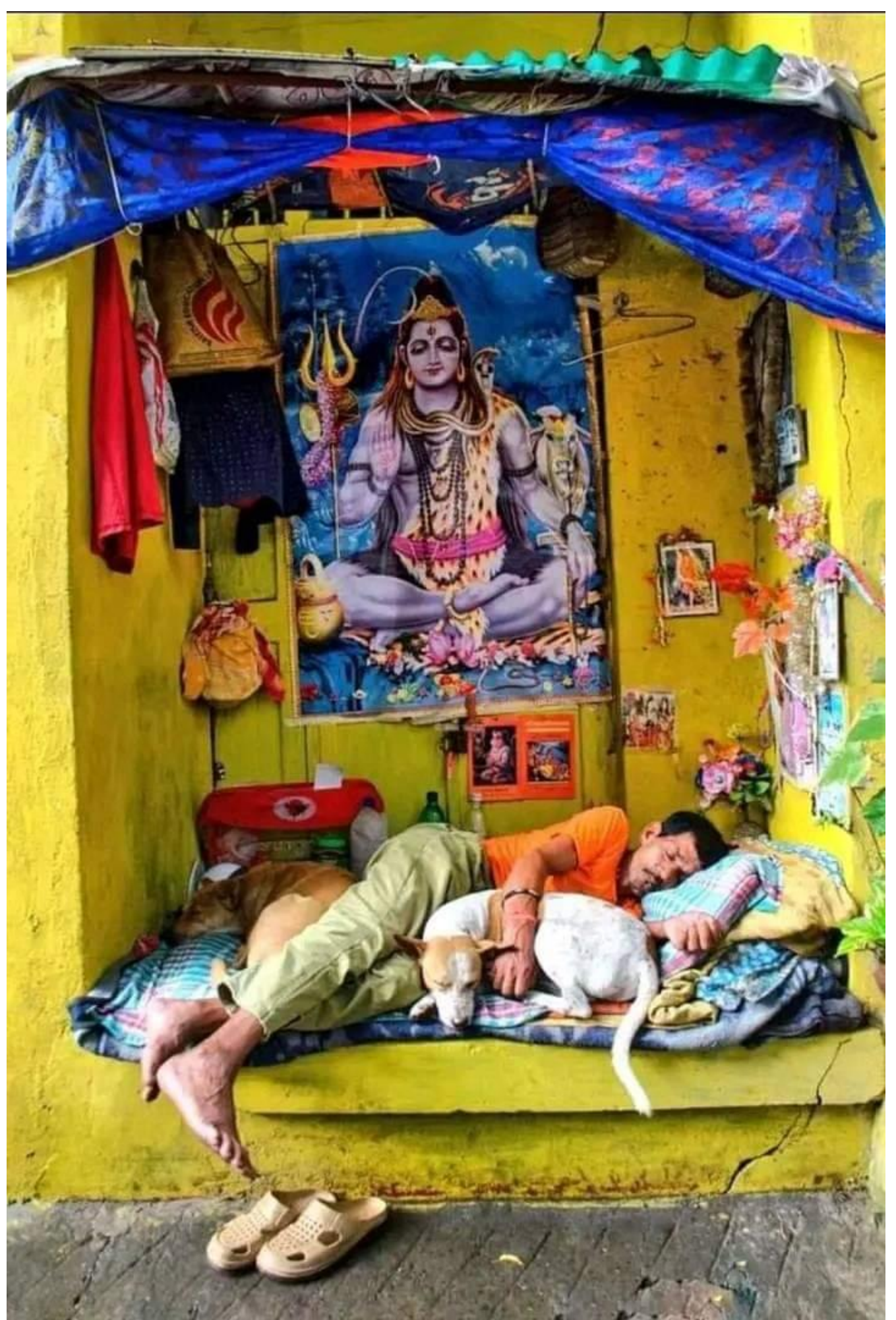
..alter their essential nature.Beings differ in their ability &intelligence bcoz of presence or absence of certain aspects of Nature, but the soul is same in all. They r manifestations of Supreme Brahman,they deserve to be treated well& allowed to