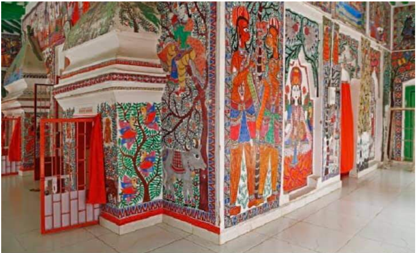
Madhubani Painting: Community - Temple, 2019, From the collection of: Dastkari Haat Samiti