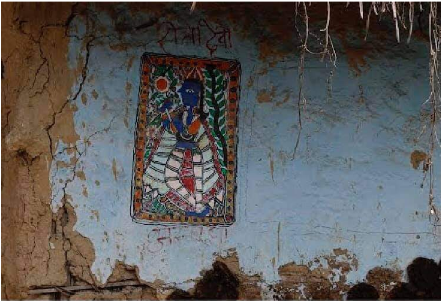
Madhubani Painting of Bihar: Community - Painting on houses, 2019

Madhubani has traditionally been painted on mud walls but in recent years, artists such as Sita Devi and Ganga Devi have made paper /canvas works that stand individually as art.