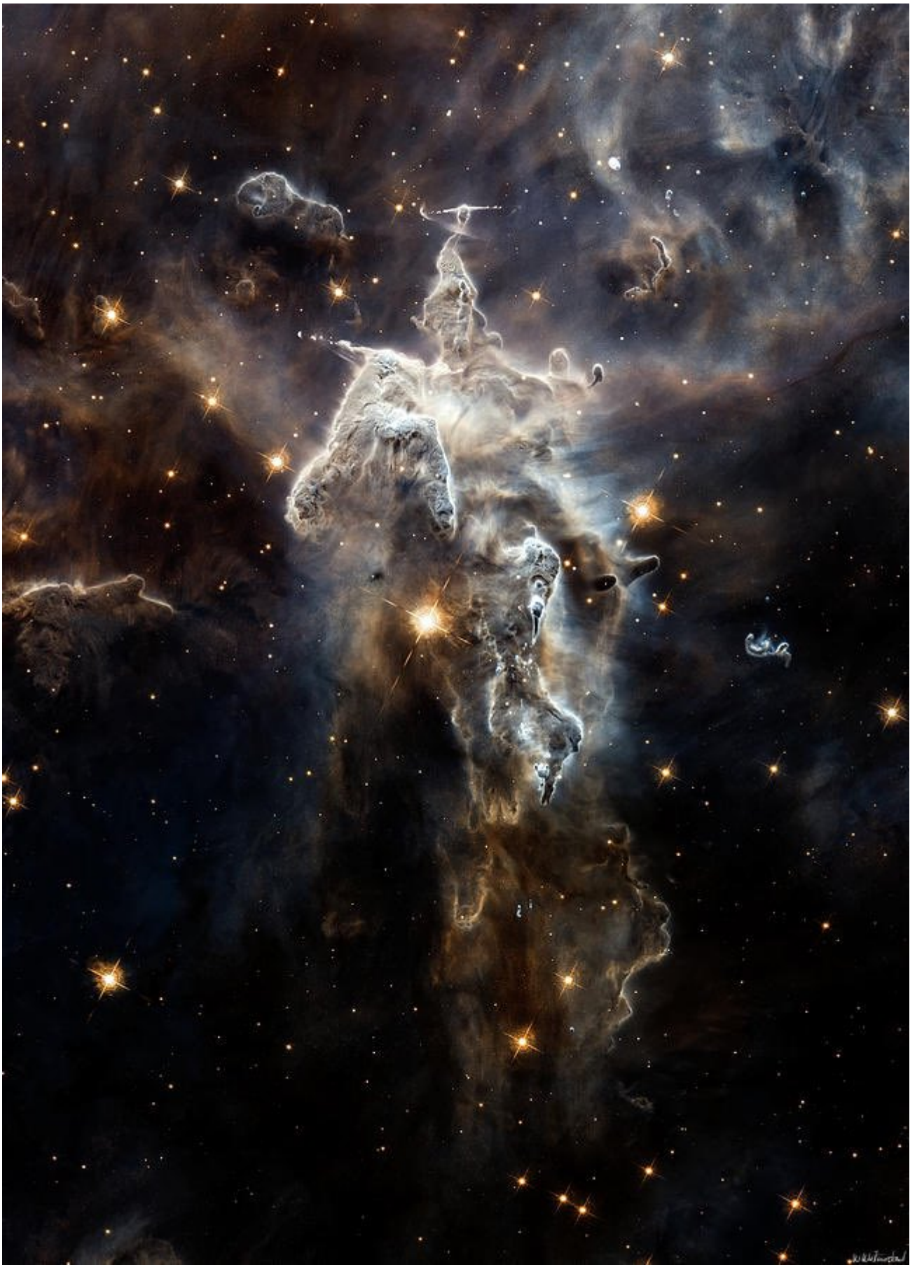
Mystic Mountain in the Carina Nebula pic.twitter.com/7LGgE16AZr

— Space Porn (@redditSpacePorn) July 15, 2022