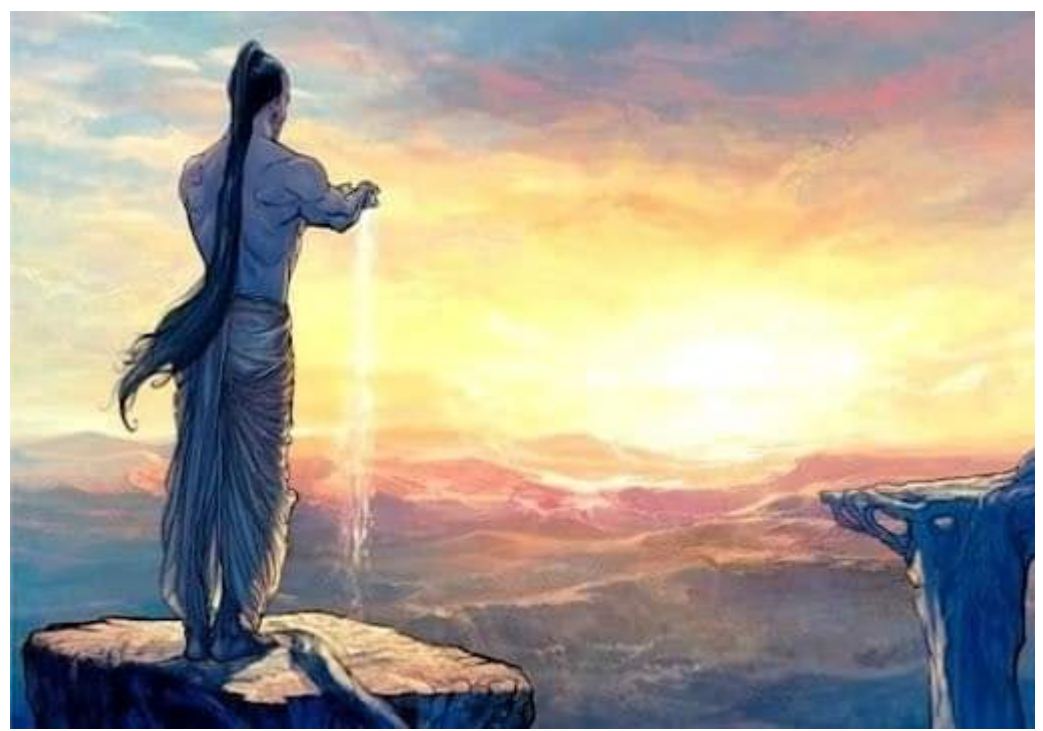
...working people/labour gives positivity to Mars.