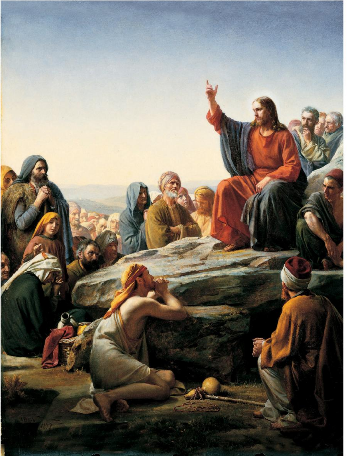
The Sermon on the Mount, by Carl Heinrich Bloch, used by permission of the National Historic Museum at Frederiksborg in Hillerød, Denmark