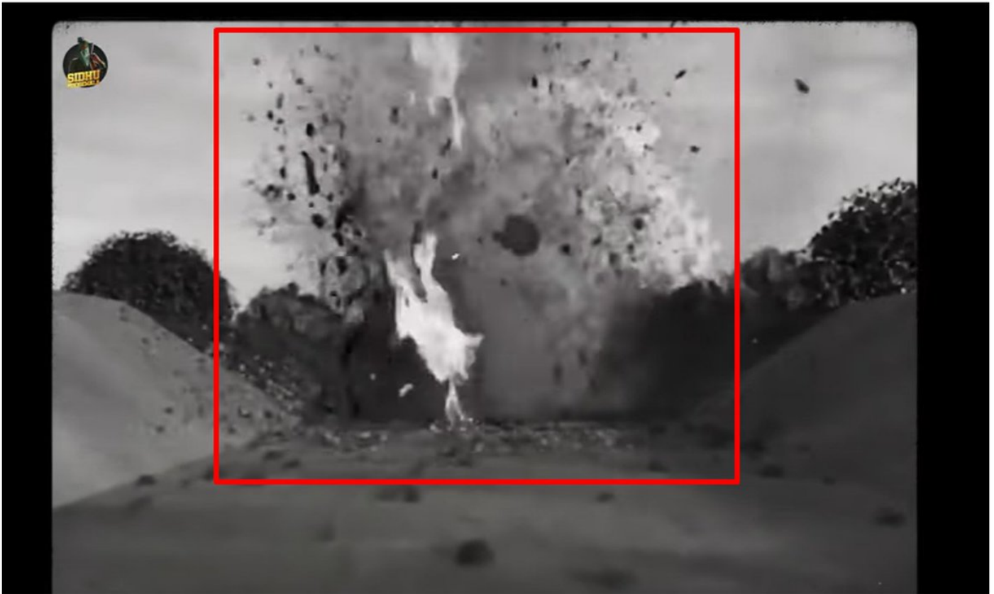
The feat in between is Punajb actor Deep Sidhu's 26th Jan pro-Kh speech along with visuals of the flag hoisting at Red Fort during 26-Jan Farmer protest in Delhi.