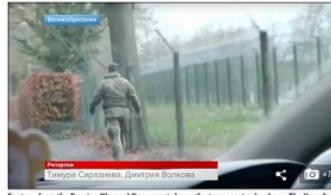
Footage from the Russian Channel One report shows the top secret cyber base. The Kremlin-funded Channel One, which boasts 250 million viewers in Russia and around the world, is widely considered as a branch of the Russian state

Their weapons are not guns but computers and fake news instead of grenades. This unit attacks online social networks and seeds panic, hostility and hatred.