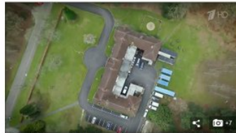
Military chiefs issued an official security warning to commanders at all of Britain's military camps after a Russian TV crew were seen filming at the 77th Brigade's base in Berkshire, with its aerial view above