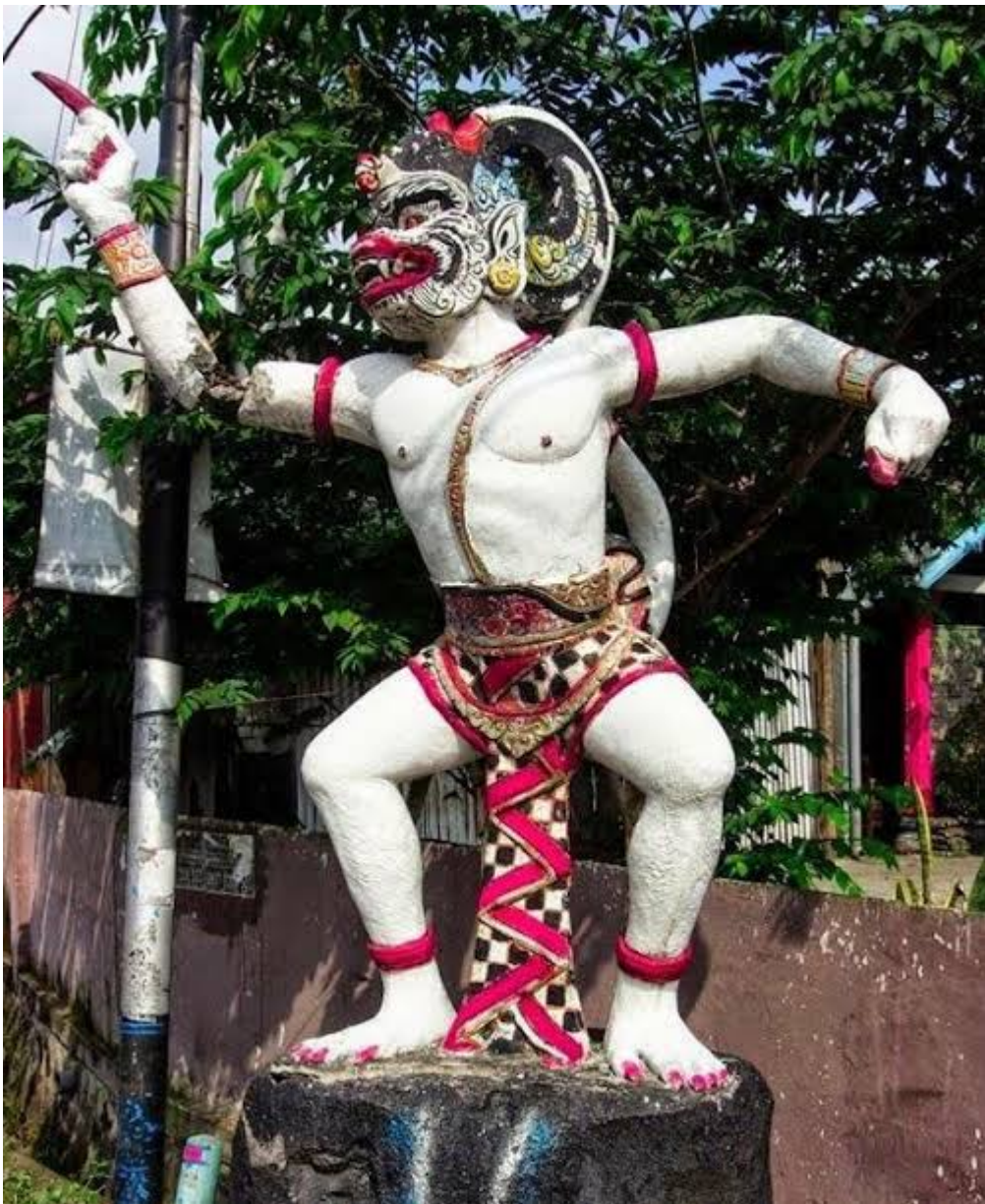
The Bali tourism logo is inspired from Hindu scriptures. International airlines of Indonesia is named Garuda Arilines, named after Vahana or Lord Vishnu. Bandung Institute of Technology, an esteemed premier educational institution of Indonesia has Ganesha as its logo.