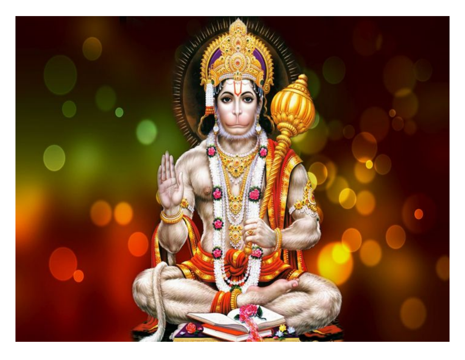
27 May 2014, this was the last date on which Hanuman Ji had come to meet the people of this tribe. It is believed that Hanuman Ji will come again in 2055 to meet the people of the tribe and give divine knowledge.