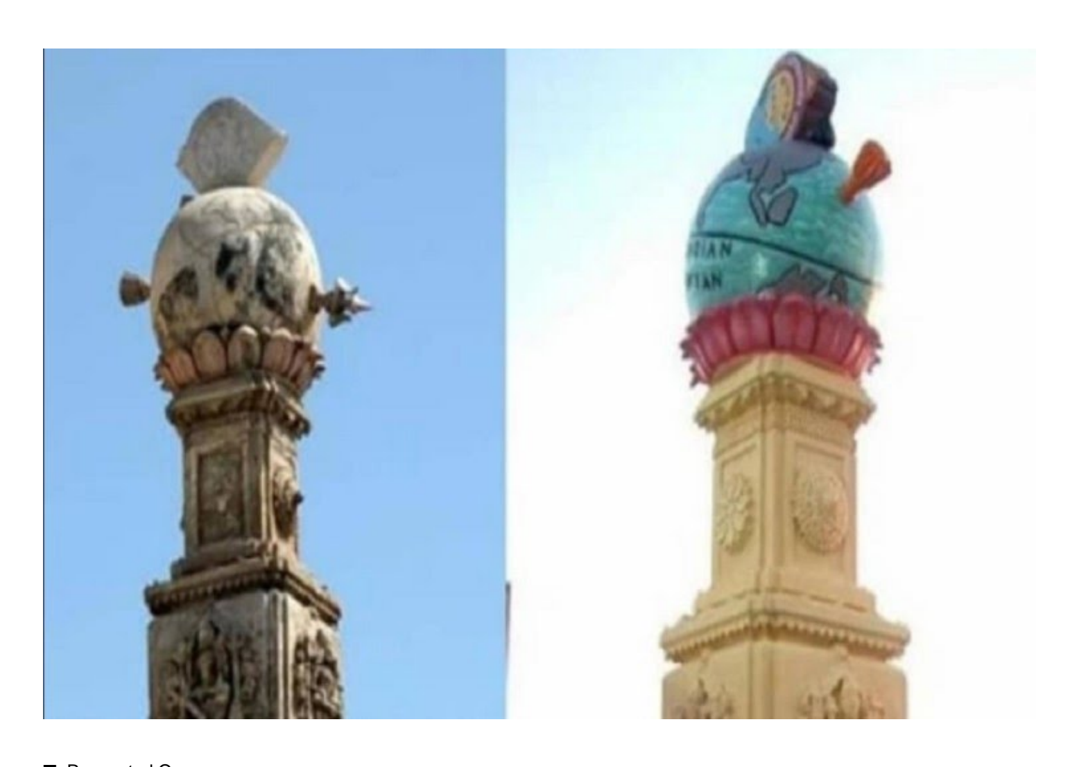
■: Respected Owner Please like, retweet and follow <u>@ranvijayT90</u> for more Facts, Unsolved Mysteries and Unexplored Places. ■