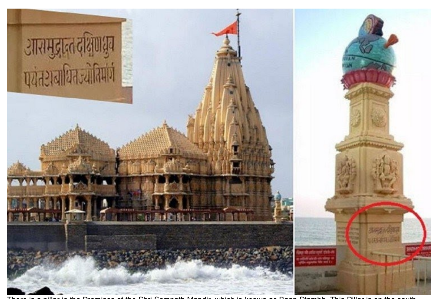
There is a pillar in the Premises of the Shri Somnath Mandir, which is known as Baan Stambh. This Pillar is on the south side of the Mandir and overlooks the sea. Researchers tried a lot but they could not know the mystery of this pillar.