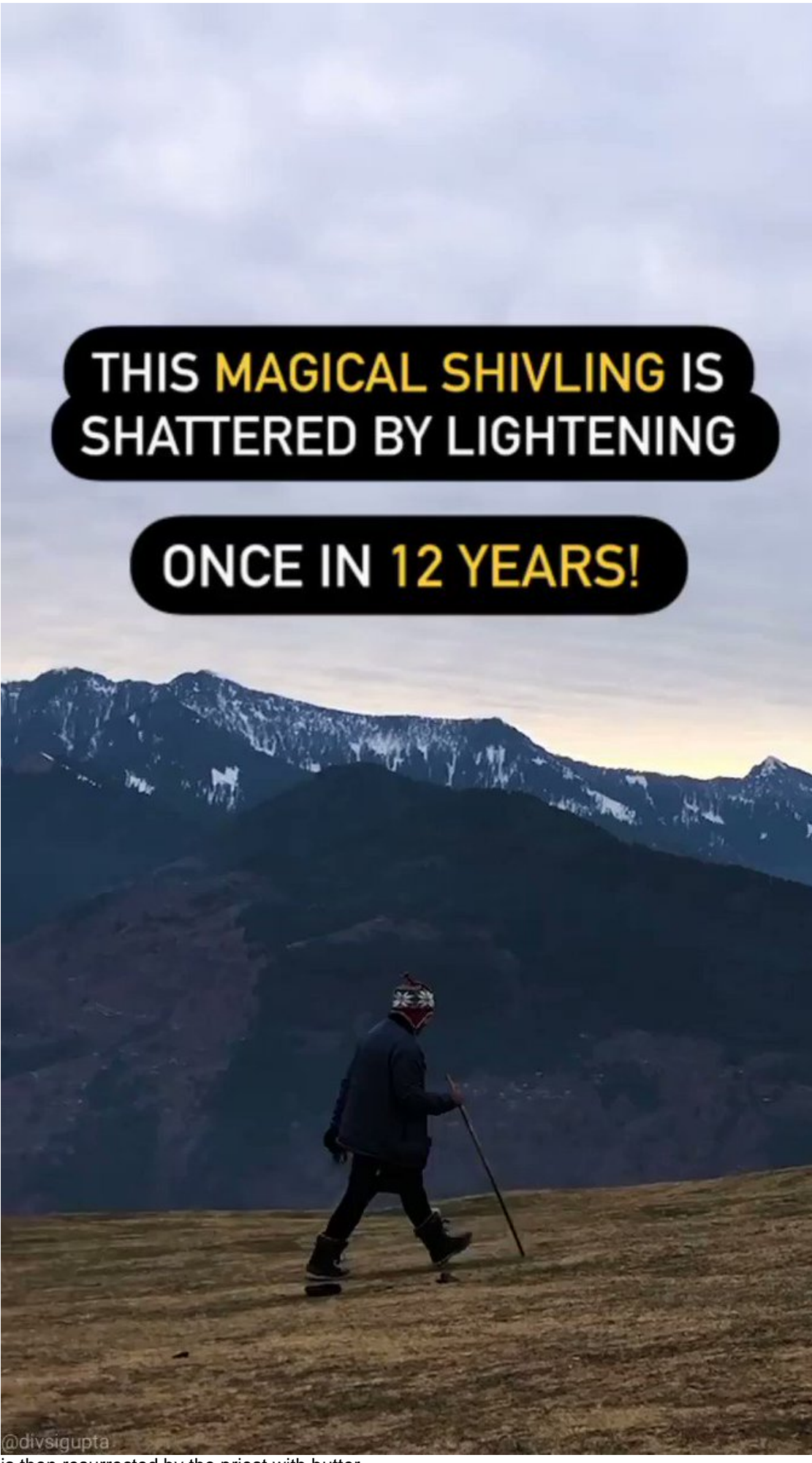
is then resurrected by the priest with butter.