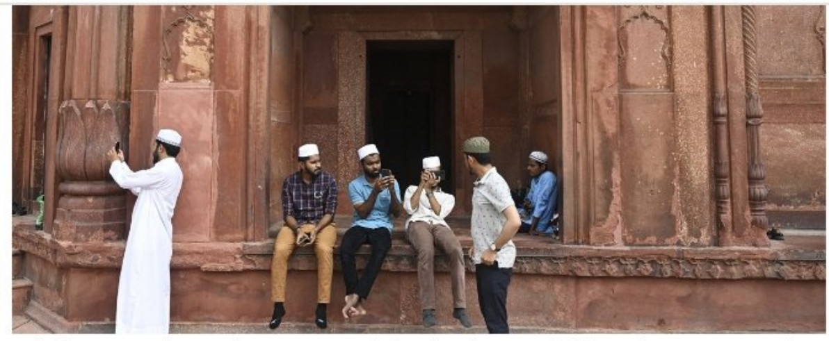
Visitors take pictures with their mobile phones at the Jama Masjid in the old quarters of New Delhi, India on September 21, 2021.

The group that ran the Hindutva Watch handle on Twitter - which flagged instances of violence and bigotry from an extreme form of Hindu nationalism - had long been accustomed to being abused and trolled for content critical of the Indian government.