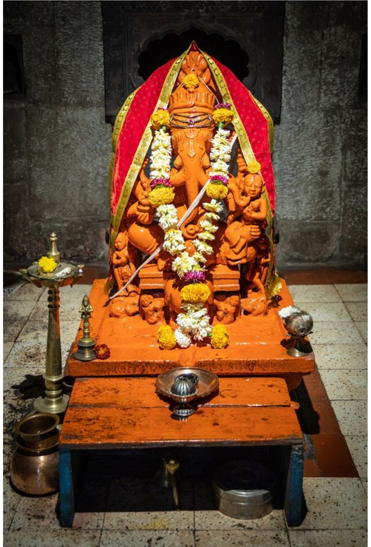
The temple has been constructed on a high platform and has a small courtyard around it which is often decorated with earthen diyas, lights and flowers on special occasions or festivals. The temple also has images and sculptures of Bhagwan Shiv on the outside.