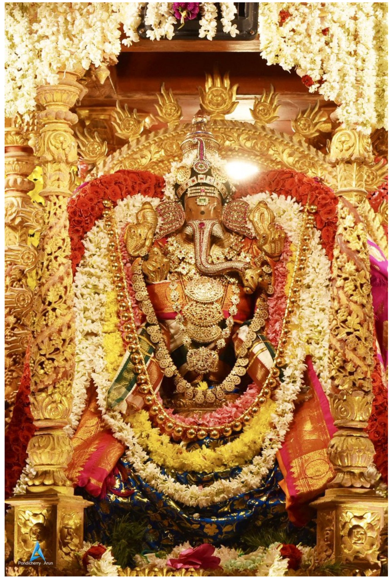
This Ganpati mandir is the only one across India which is covered fully with gold on its tower.