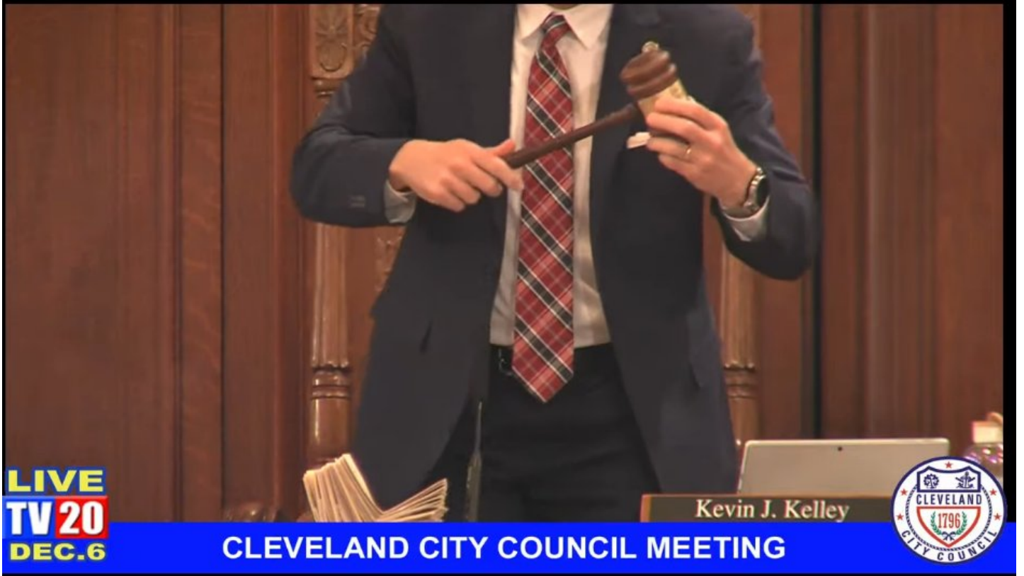
Cleveland City Council meeting for Monday, December 6, 2021 is adjourned at or around 9:45 PM.