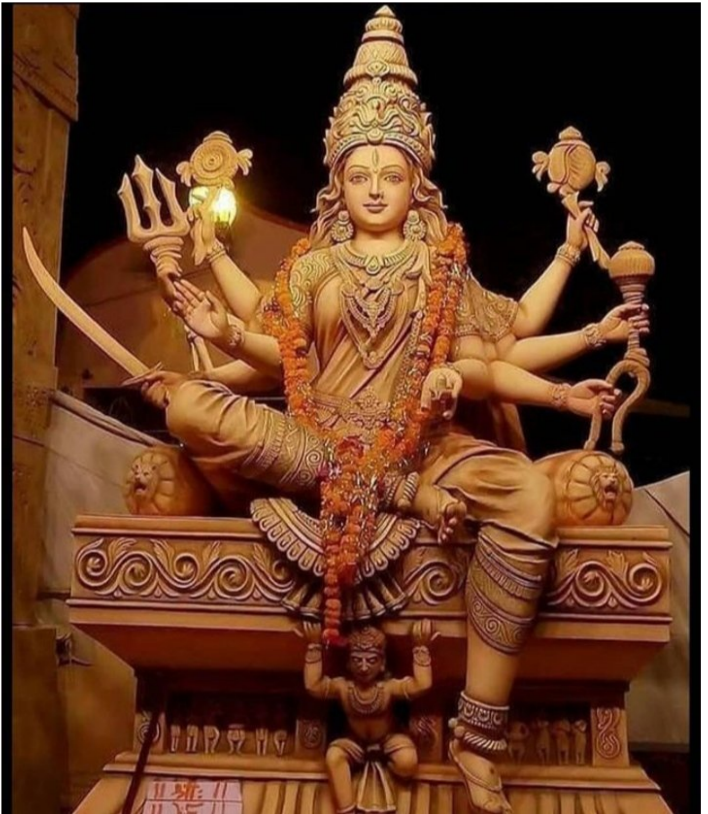
Goddess Lalita Tripura Sundari, the goddess of power, is considered as her Saguna Svarupa (Manifested form) i.e. Lalita Tripura Sundari is the truest material form of the Goddess, possessing the three qualities (satva, rajas and tamas).