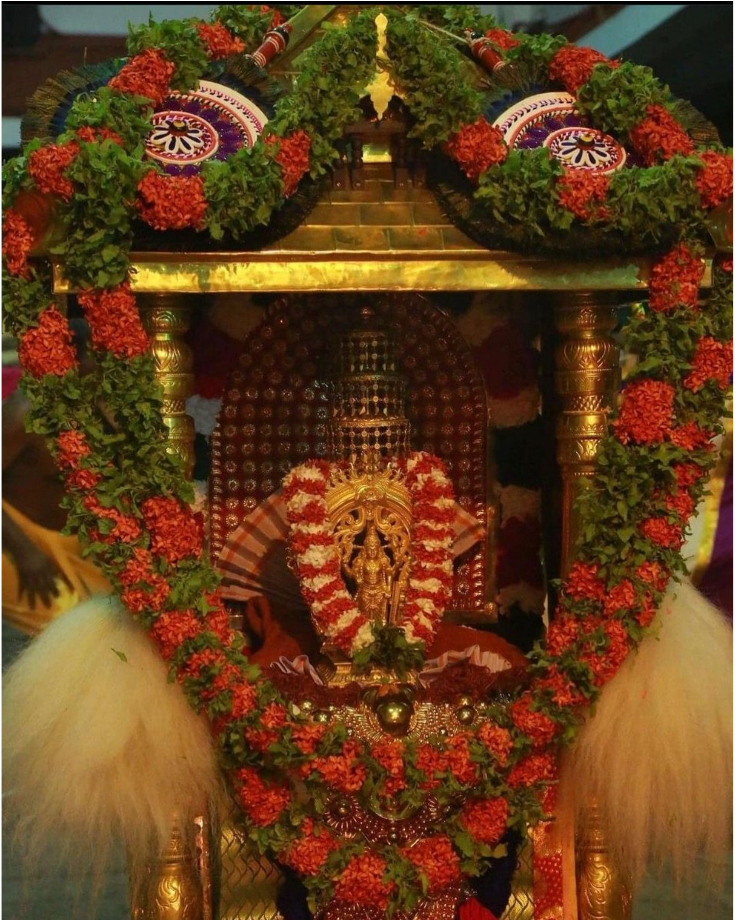
Paramashiva & Parvati Devi is worshipped at Mammiyur nearby and the worship at Guruvayur is not complete if one does not visit Mammiyur Mahadevan. Ekadasi is very important here.