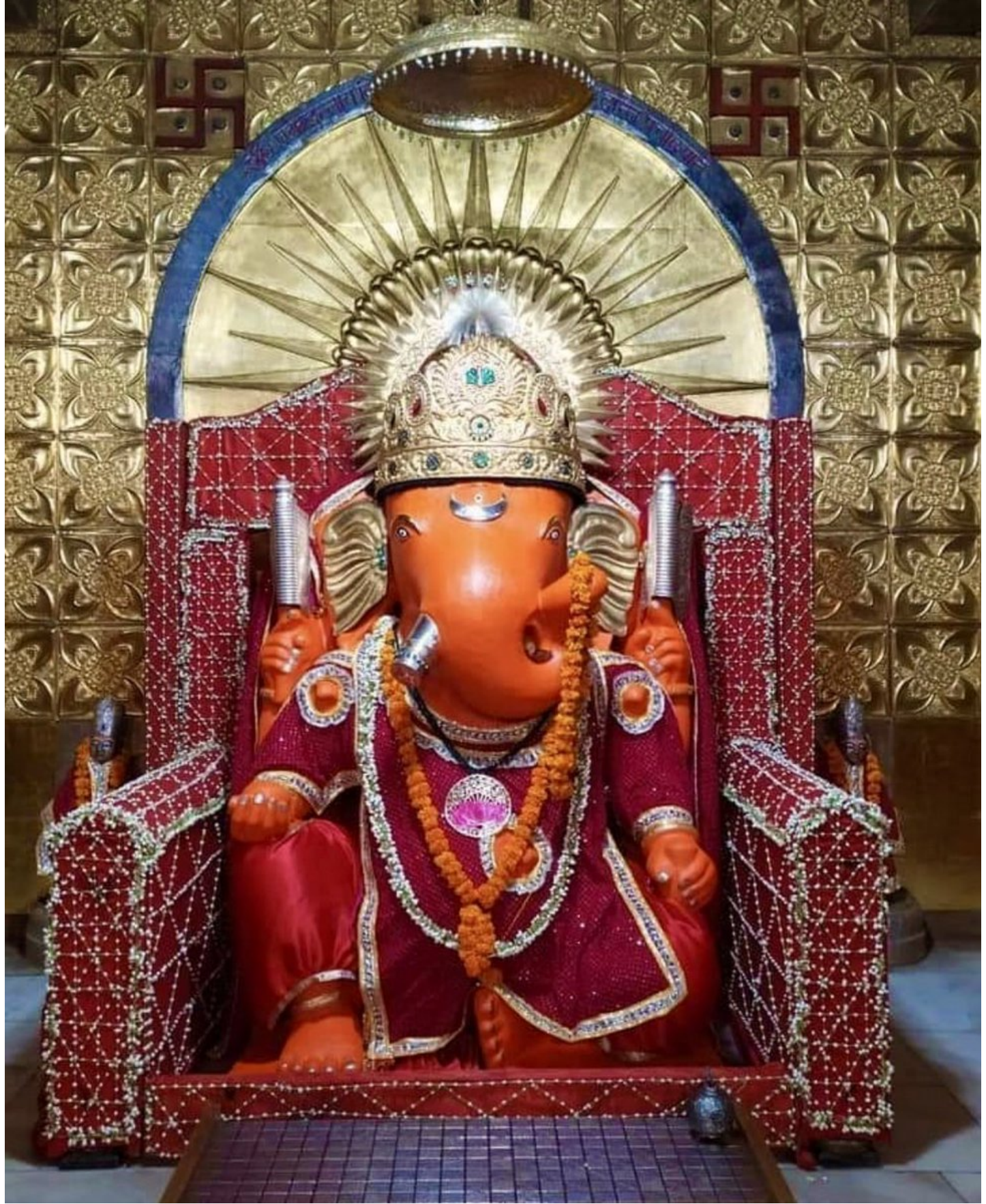
Legend is that in 17th century when the King of Mewar was returning home, he carried a Ganesha murti with him on a bullock cart. He declared that wherever the bullock cart first stopped, he would build a mandir for Ganesha. The cart stopped at the foothill of Moti Doongri.