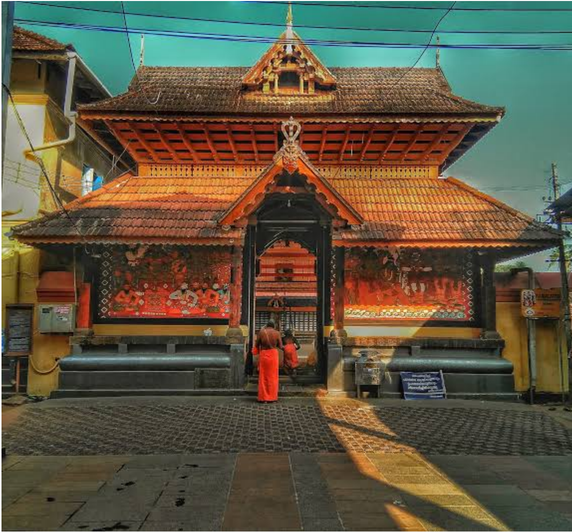
Tripayar Ekadashi, one of main festival here is observed on the month of Vrishchikam. On the Ekadasi day, Shri Rama is taken in procession accompanied by twenty-one elephants. The temple along with 3 other temples of Lakshmana, Bharata and Satrugna are called Nalambalam.