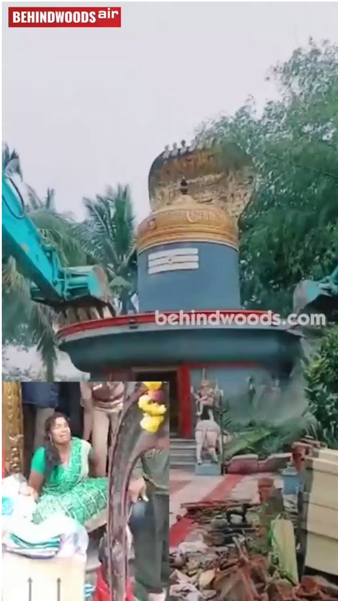
■r■ Kanaka K■ ■ ■varar is one of the 108 important Siva temples located around Kanchi K■m■k■ ■ ■