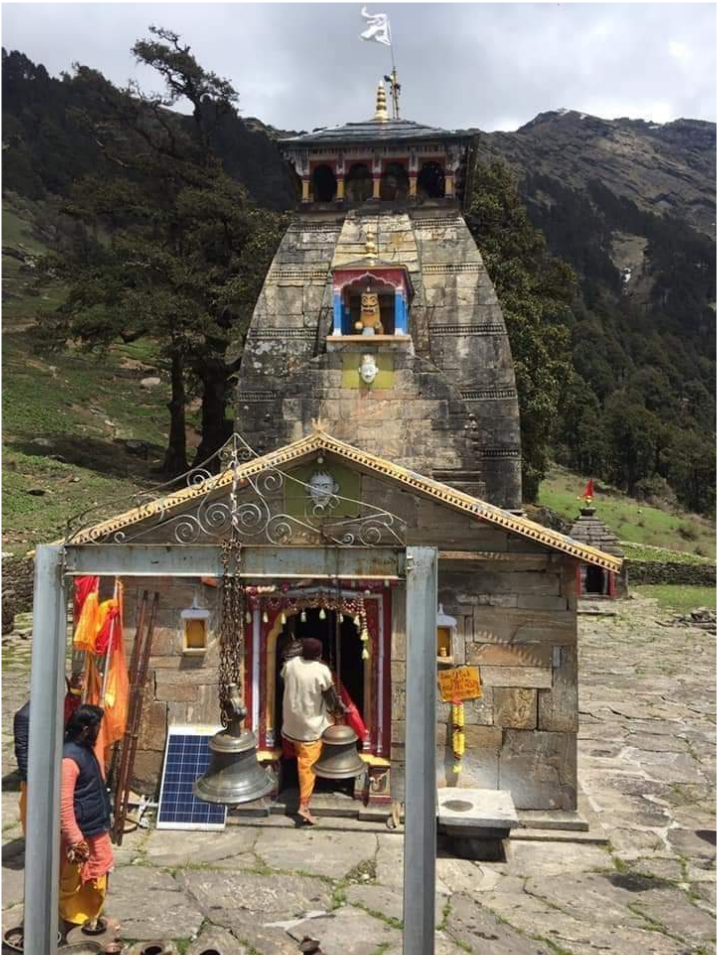
5. Kalpeshwar: this temple is located at the elevation of 2200mts, in the Garhwal region of Uttarakhand, it is the only Panch Kedar temple accessible and open throughout