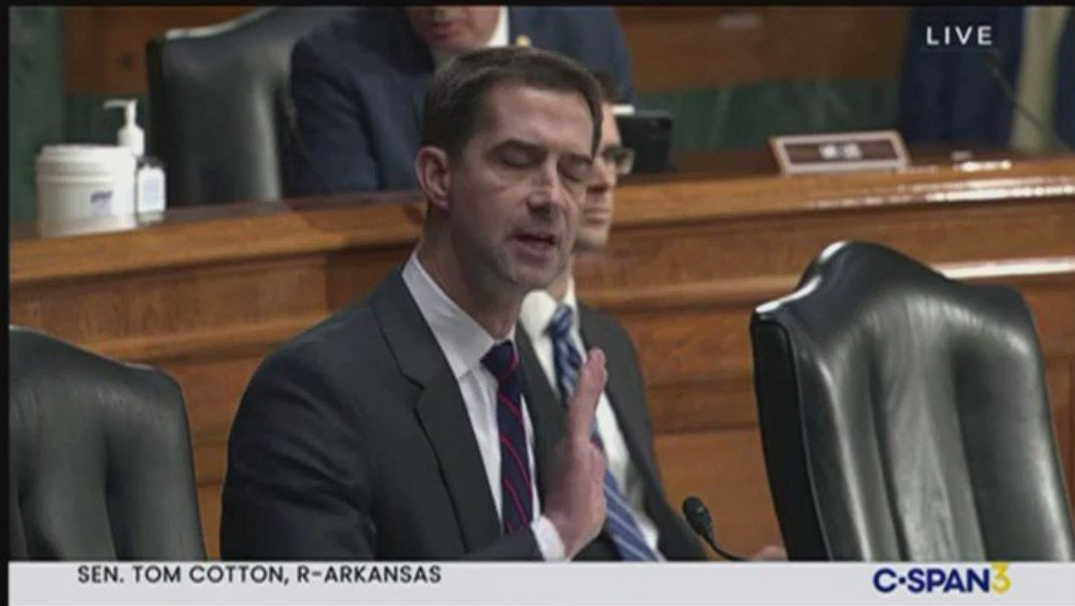
Tom Cotton leaves the hearing room in a huff