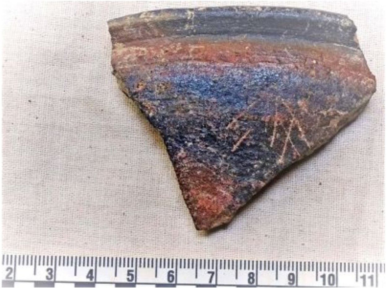
Black and red ware pottery with fish graffiti.

The excavation at Keezhadi has been carried out at two localities in the farm.