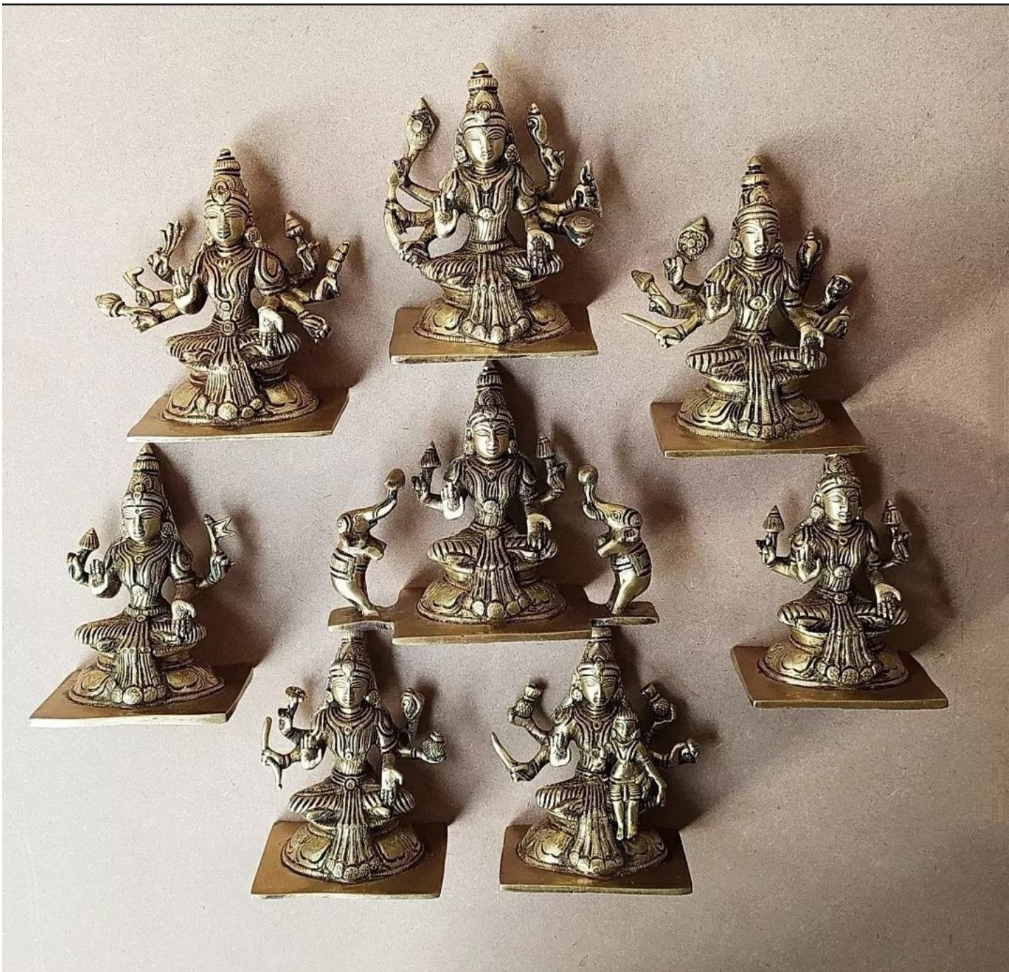
Vijaya Lakshmi Vijaya Lakshmi, whose first name means “victory,” is a significator of success, instilling devotees with hope and inspiration.