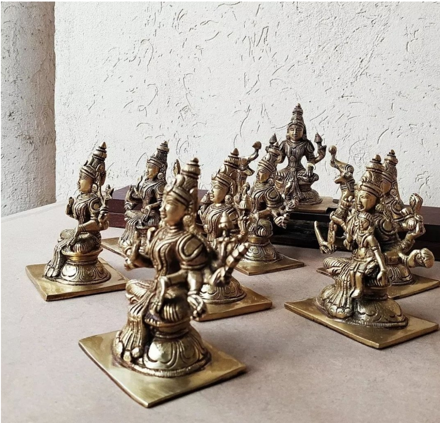
Santana Lakshmi Traditionally prayed to by couples desiring children, Santana Lakshmi (santana meaning “progeny,” or “children”) symbolizes fertility.