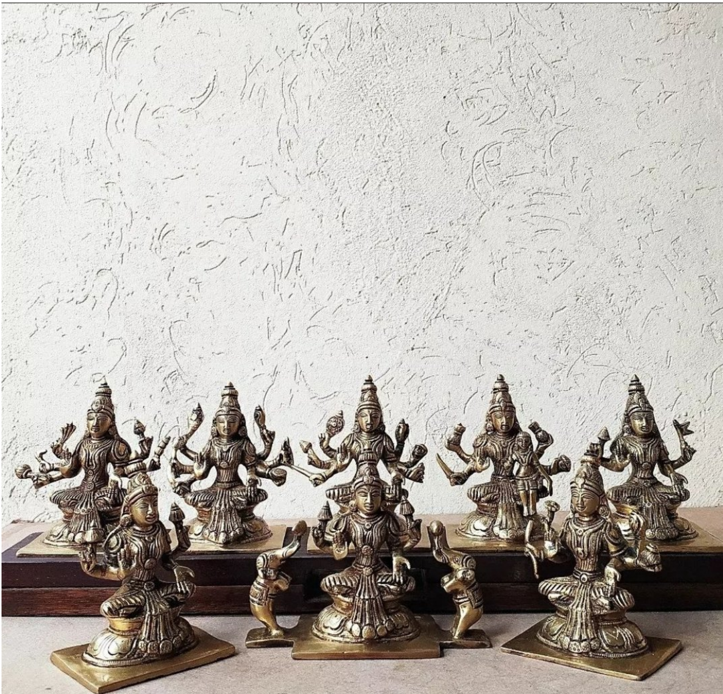
Dhanya Lakshmi Dhanya means “blessed,” and as life would be impossible without food, Dhanya Lakshmi blesses devotees with the great fortune of agricultural wealth.