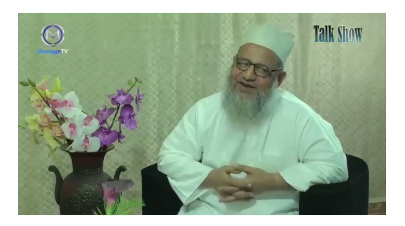
Kaleem Siddiqui : "Don't try to give logic to convert non-Muslims to Islam. Convert them using 2 tools. 1. Lust for Jannat 2. Fear of hellfire"

All such conversions by Islamic preachers must be technically declared illegal coz it includes threats & deceit