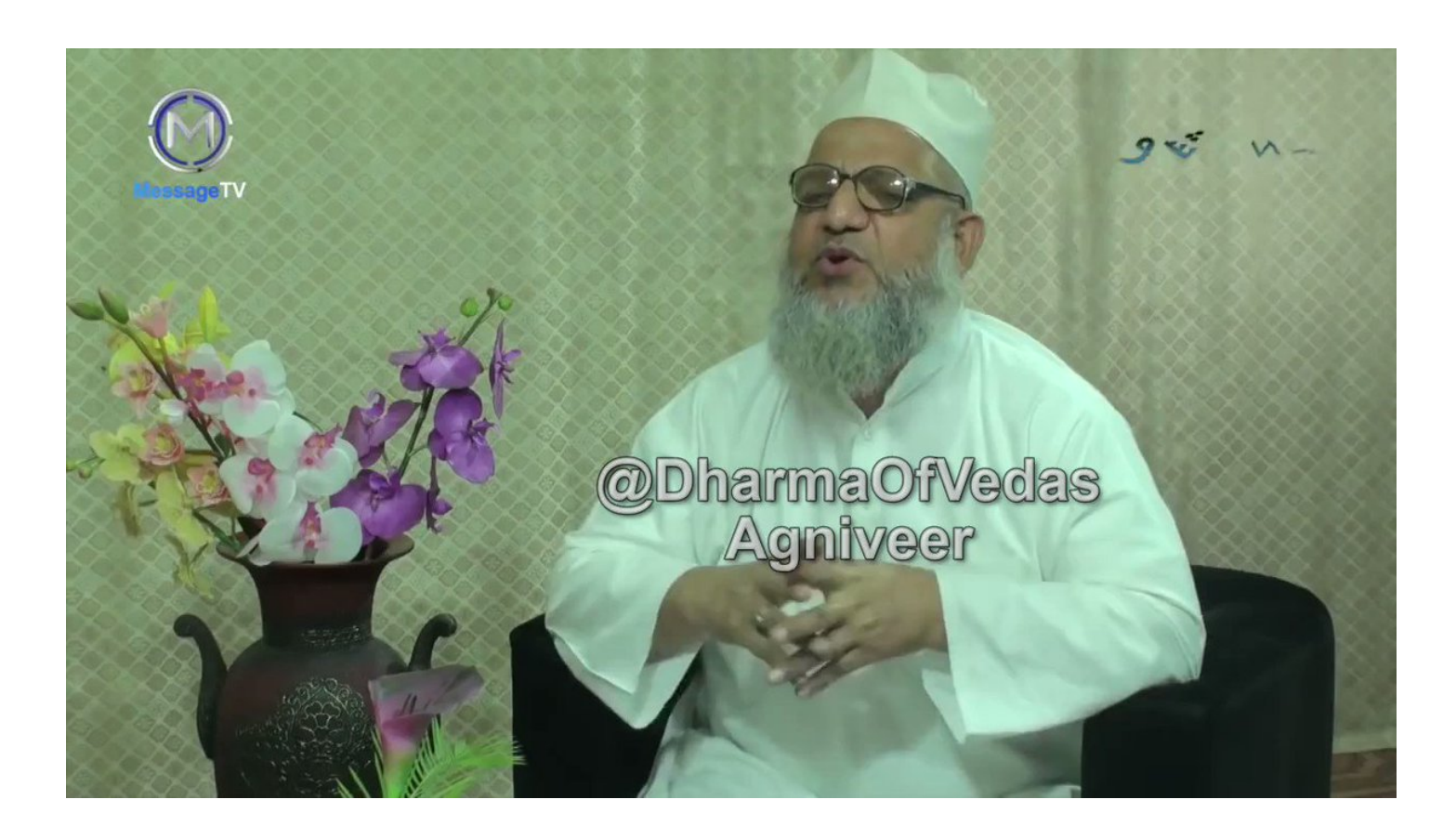
Q. Which is most effective strategy to convert Hindus?

How this man converts 15 Hindus to Islam daily at his Madarsa conversion center Phulat, Muzaffarnagar, UP.