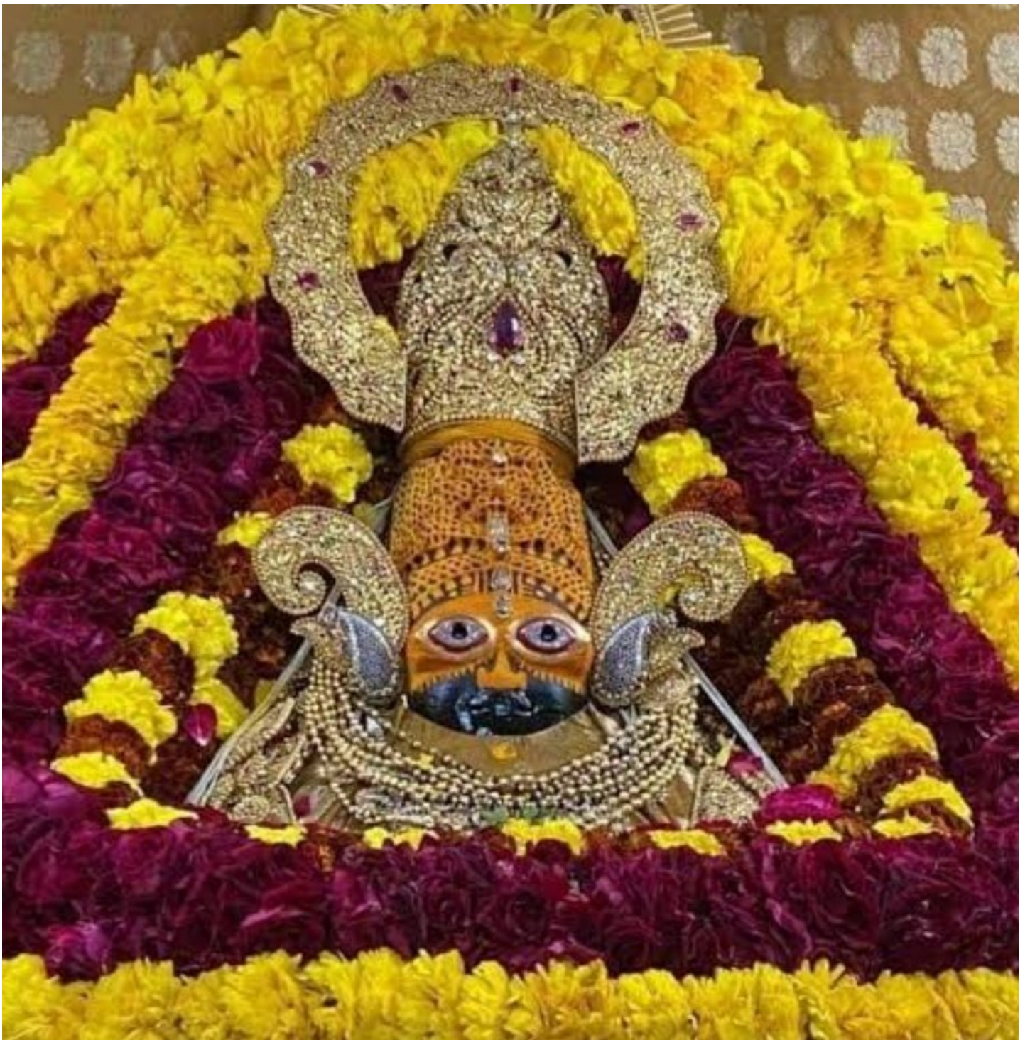
On the day of Amavasya, devotees get the darshan of Shyam Baba in Shyam varan (black color). In ordinary days, the form of Baba is saffron. The reason for this is a custom. The real head of Shyam Baba which had appeared from Shyam Kund is of Shyam varan.