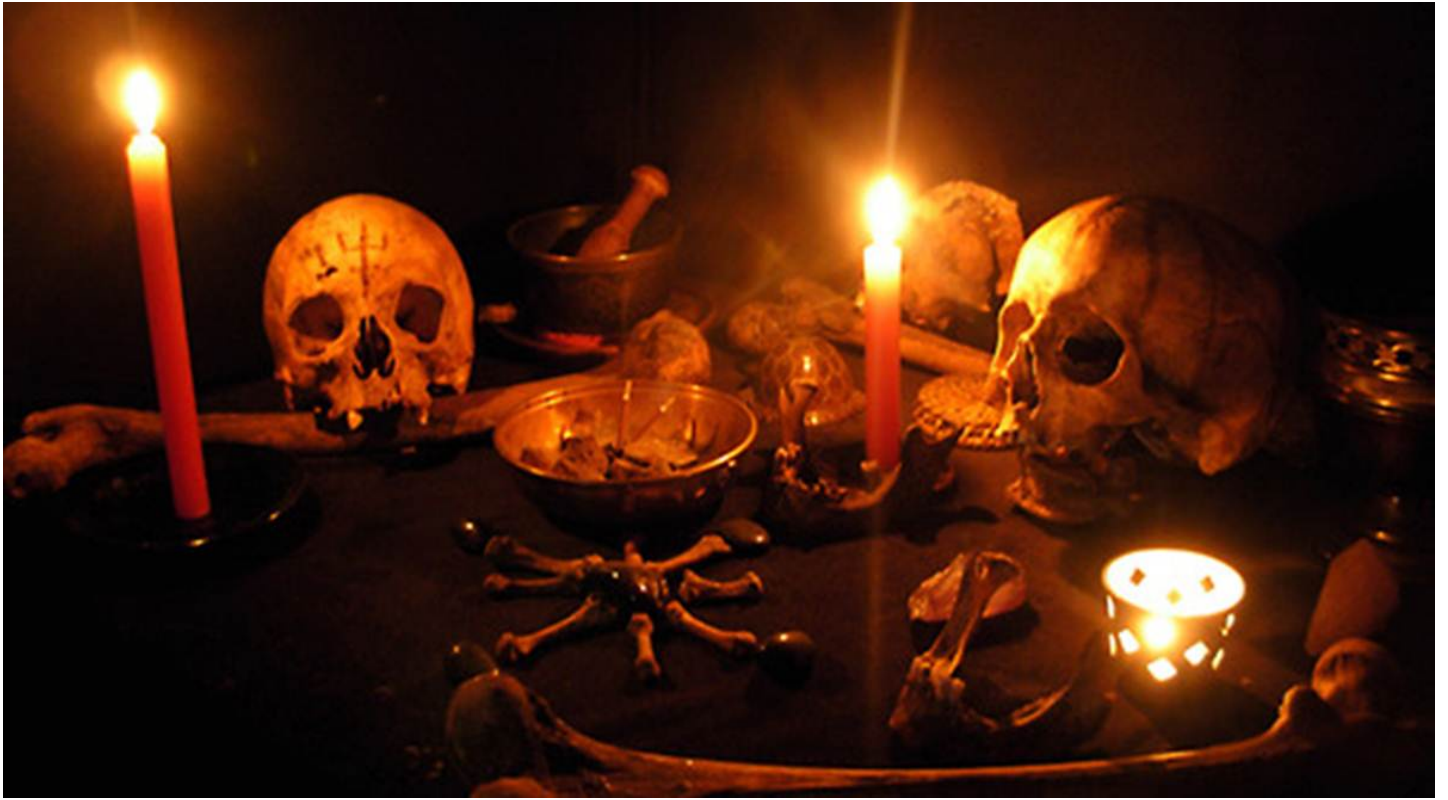
Mayong is known as the 'Land of Black Magic'. It is also speculated that black magic started in the whole world from this village. The people here believe that this village belongs to Ghatotkach, son of Bheem. Ghatotkach was the king of Mayong.