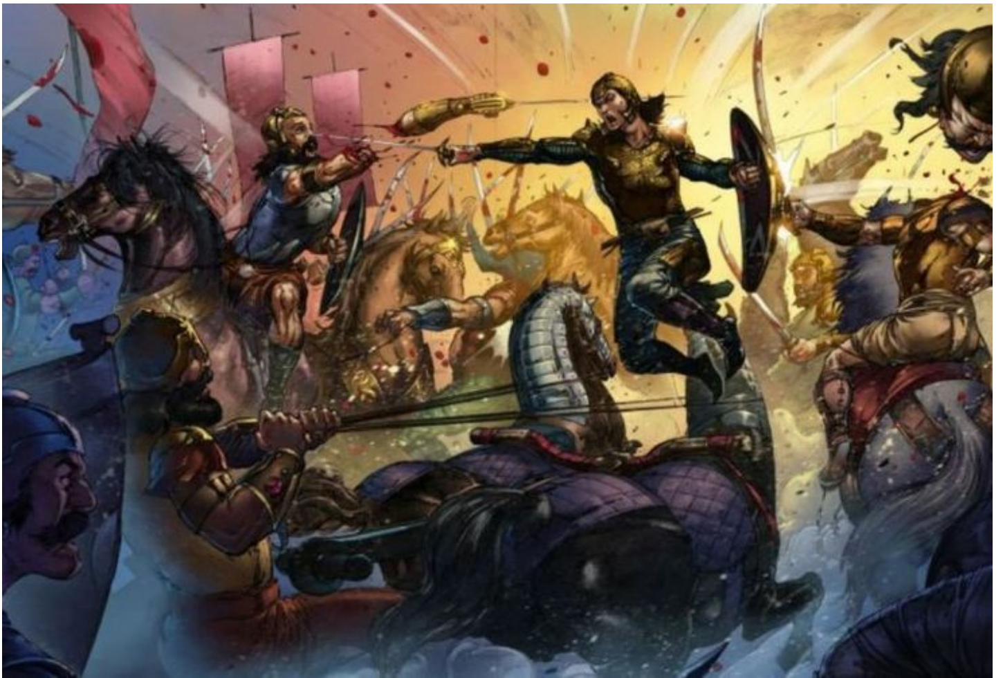
Abhimanyu competently penetrated the Chakravyuh. But then Kauravs encompassed him with deceit and kll|ed him. It is believed that in the Mahabharat, Abhimanyu entered the Chakravyuh from Thanesar, Kurukshetra.