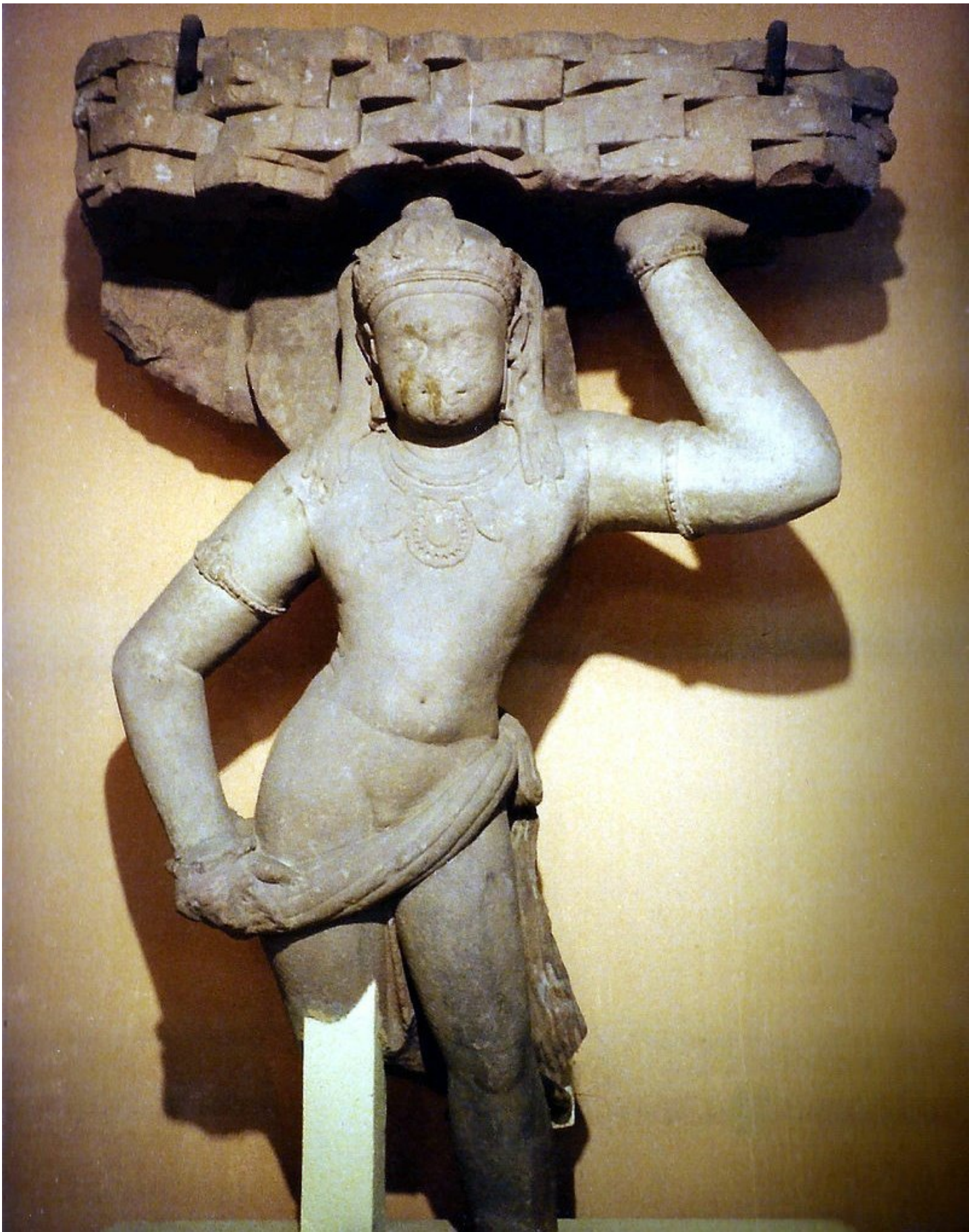
4] 7th Century sculpture from Danang, Vietnam