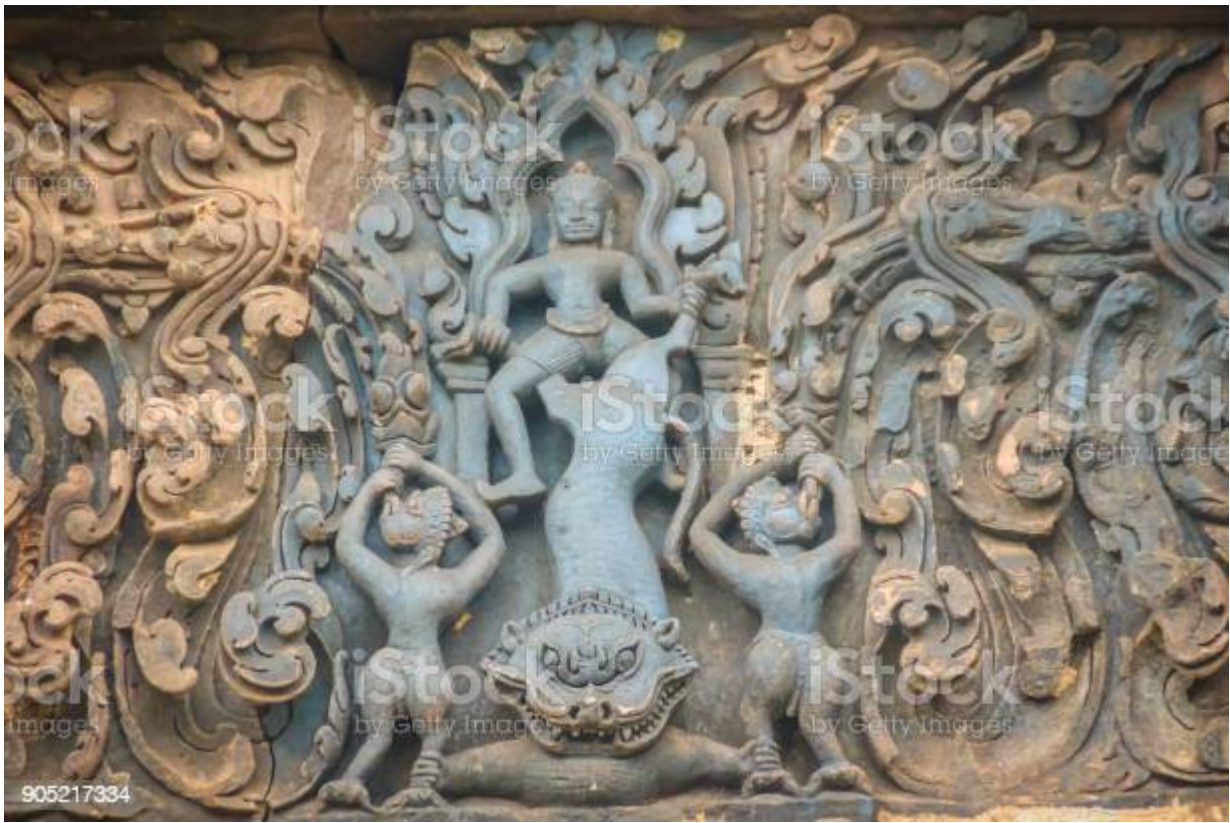
9] 11th Century sculpture from Cambodia showing Lord Krishna Lifting Mount Govardhan