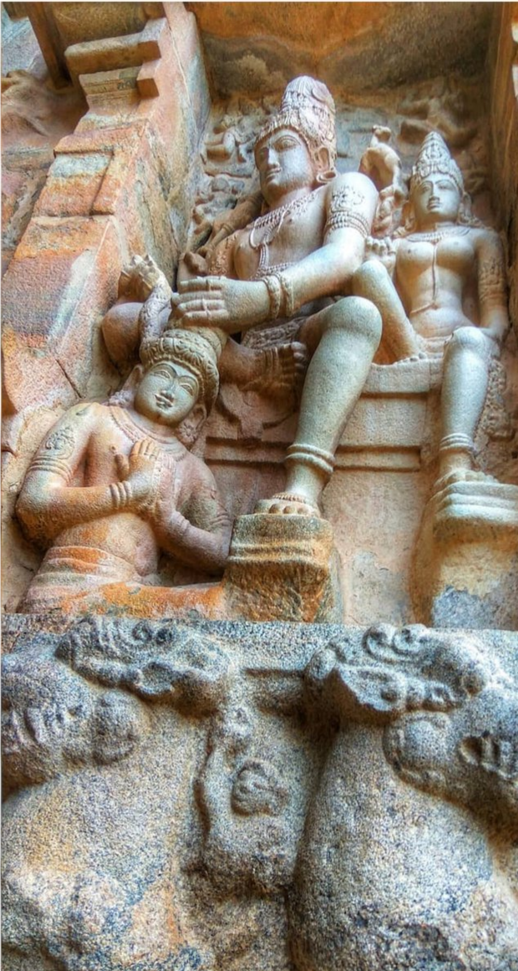
Chandeshwara/Chandikeshwara is regarded as custodian of Shiva Temple's wealth&most of Shiva temples in South India has separate sannathi for him.