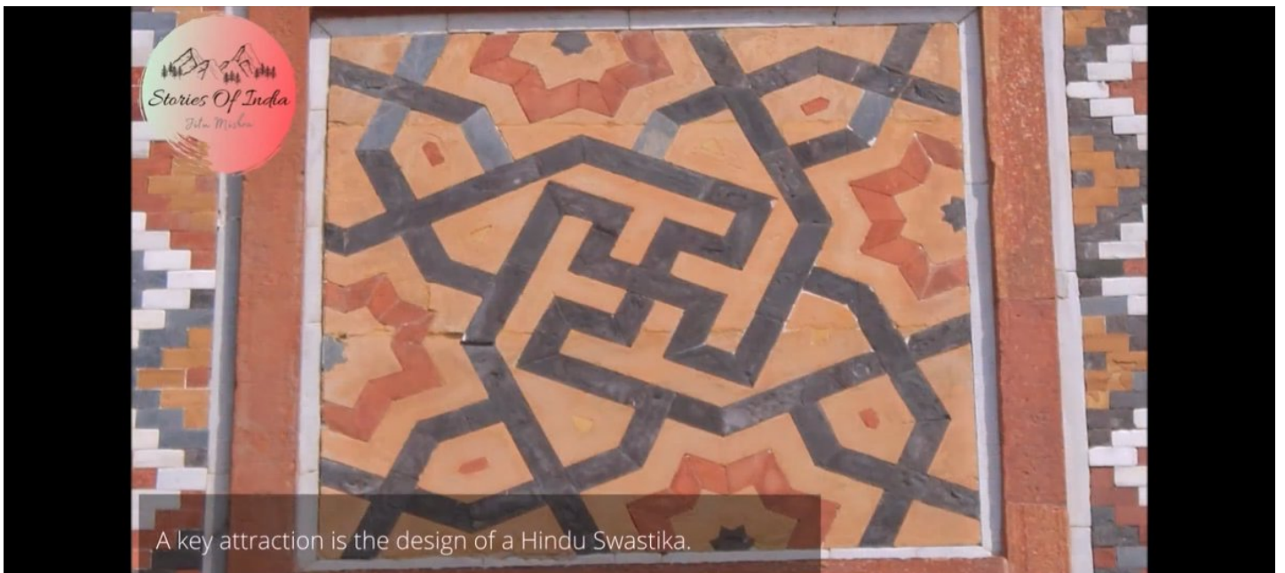
A key attraction is the design of a Hindu Swastika.