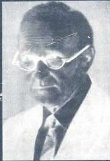
Associated Press, 1977

In the 1950's and early 1960's, the agency gave mind-altering drugs to hundreds of unsuspecting Americans in an effort to explore the possibi-