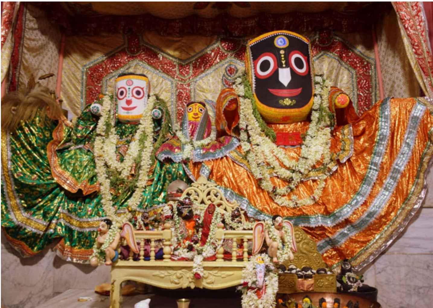
We call it Mahesh er Rathyatra This is the 2nd most oldest Rathyatra after Puri & the oldest in Bengal. Lakhs of people visit here every year for Darshan thus making it famous.