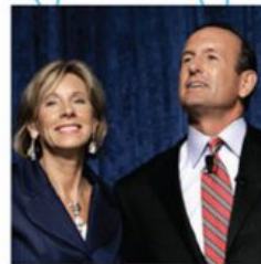
Richard "Dick" DeVos Jr. and Betsy DeVos