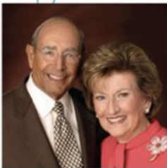
Richard DeVos Sr. and Helen DeVos