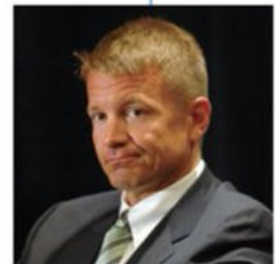
Erik Prince (brother of Betsy DeVos)