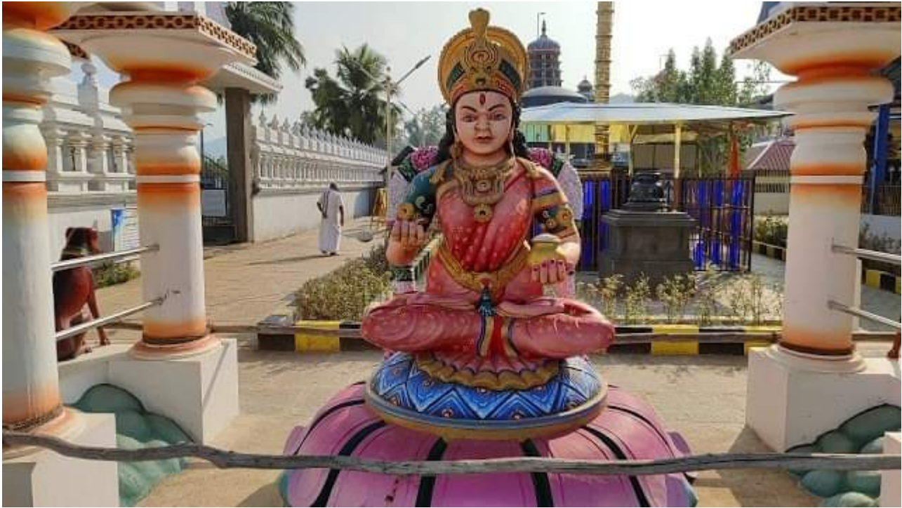
The Sthala Vriksham "Peepal Tree" which is grown on a pedestal, a trident which is considered as Bhairavi, Pancha Mukha Anjaneya, Prathyankara Devi, Subramanya, Rudra Vinayaga, Vaishnavi Devi, Naga Rudra, Eswara, Vana Durga etc. 5/5