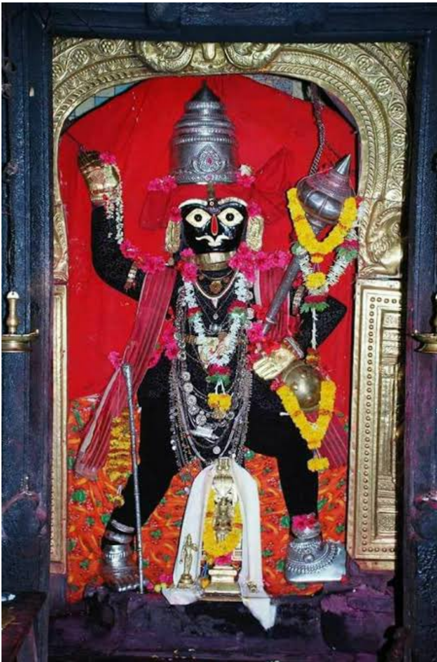
Several thousands of years ago, Hanuman lived in this village. He once saw the Sun and mistaking it to be a fruit, began flying towards it. Since then, this village came to be known as Kadara Man Dalagi. (Kadar means rays, mandala is cluster of rays).